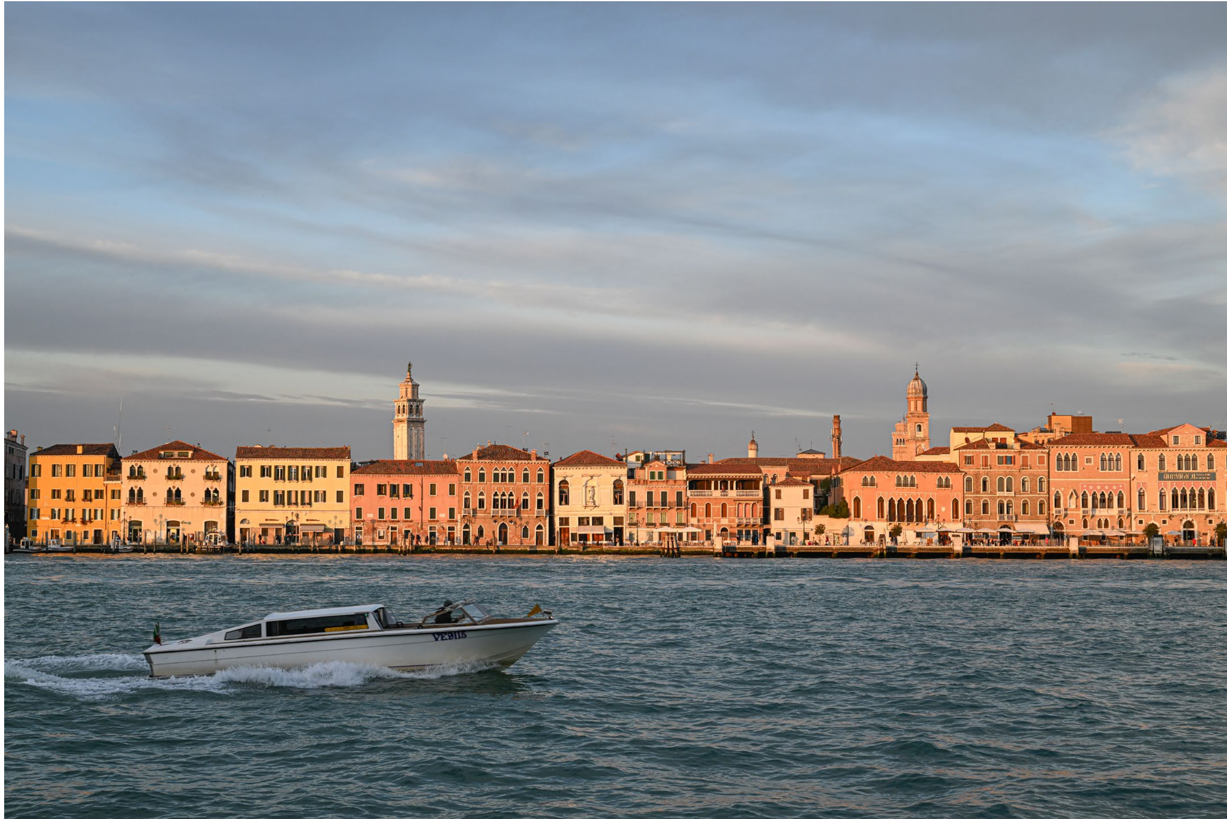
Towers AND boats.