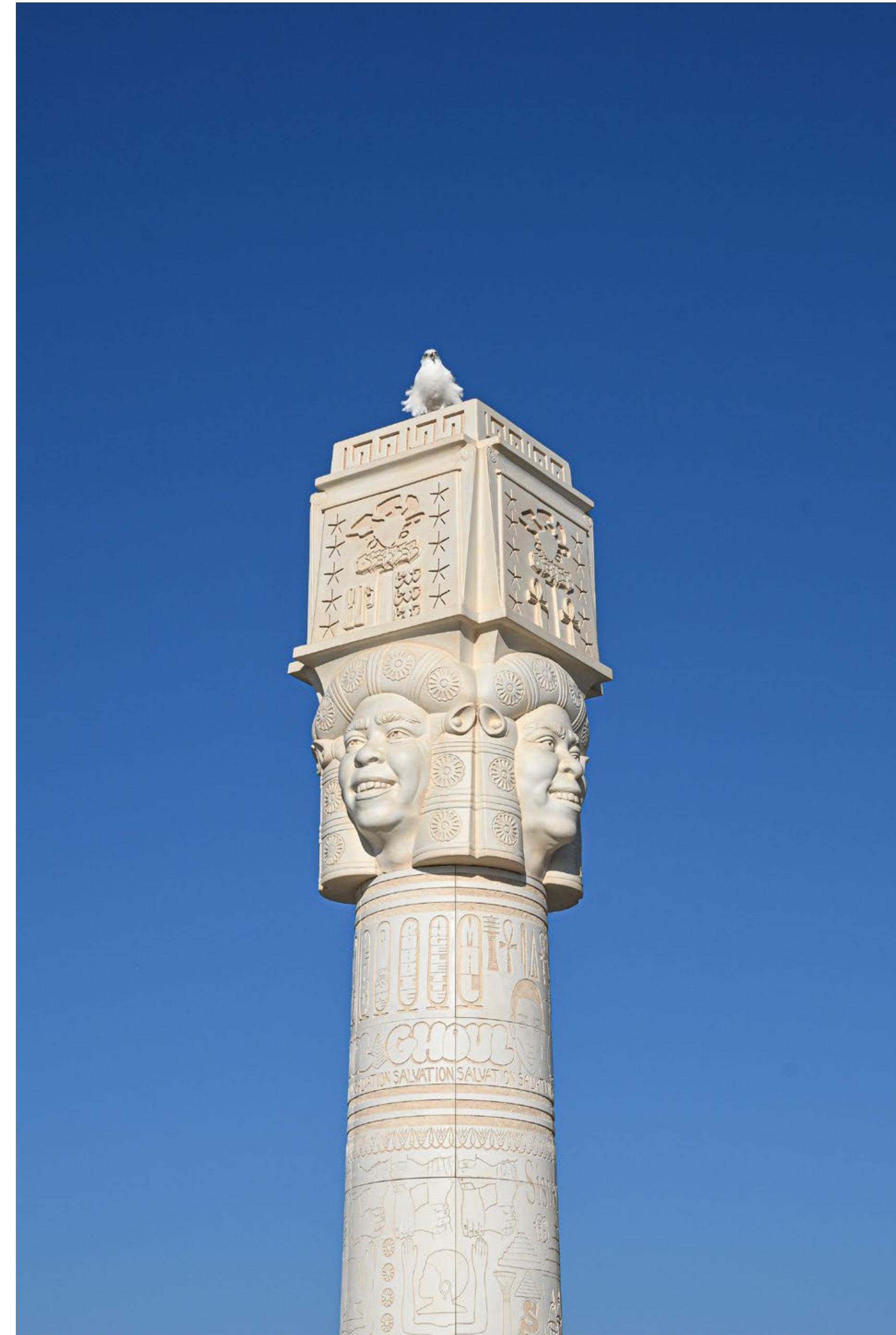
Left: Lazy pigeons found slacking off around-the-clock. | Right: Marilyn Monroe bird on hipster pillar.