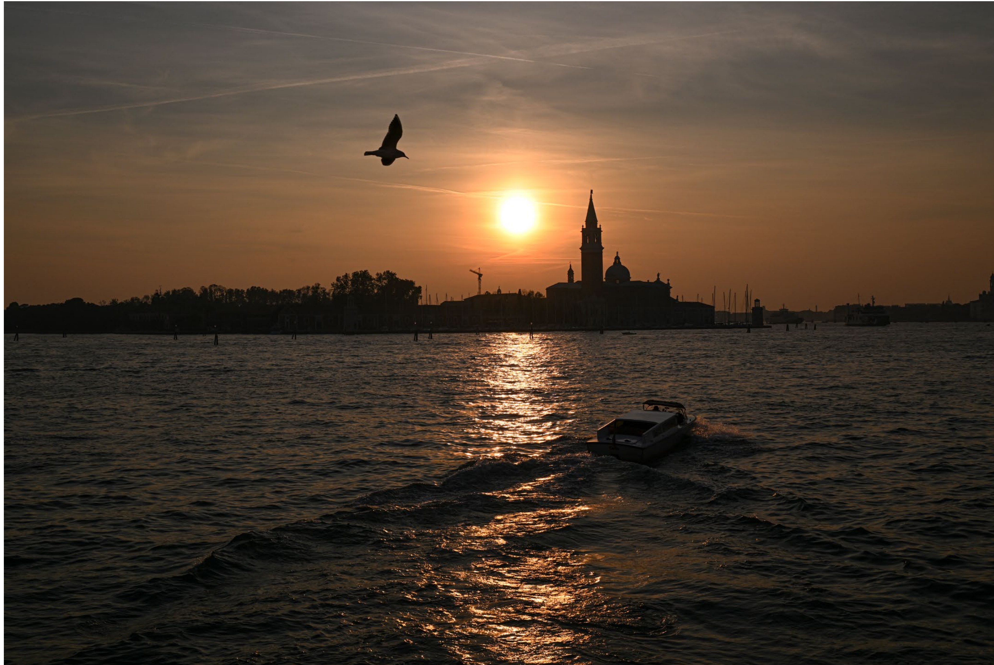
The sun sets on Venice. The sky is full of the condensation trails of planes.