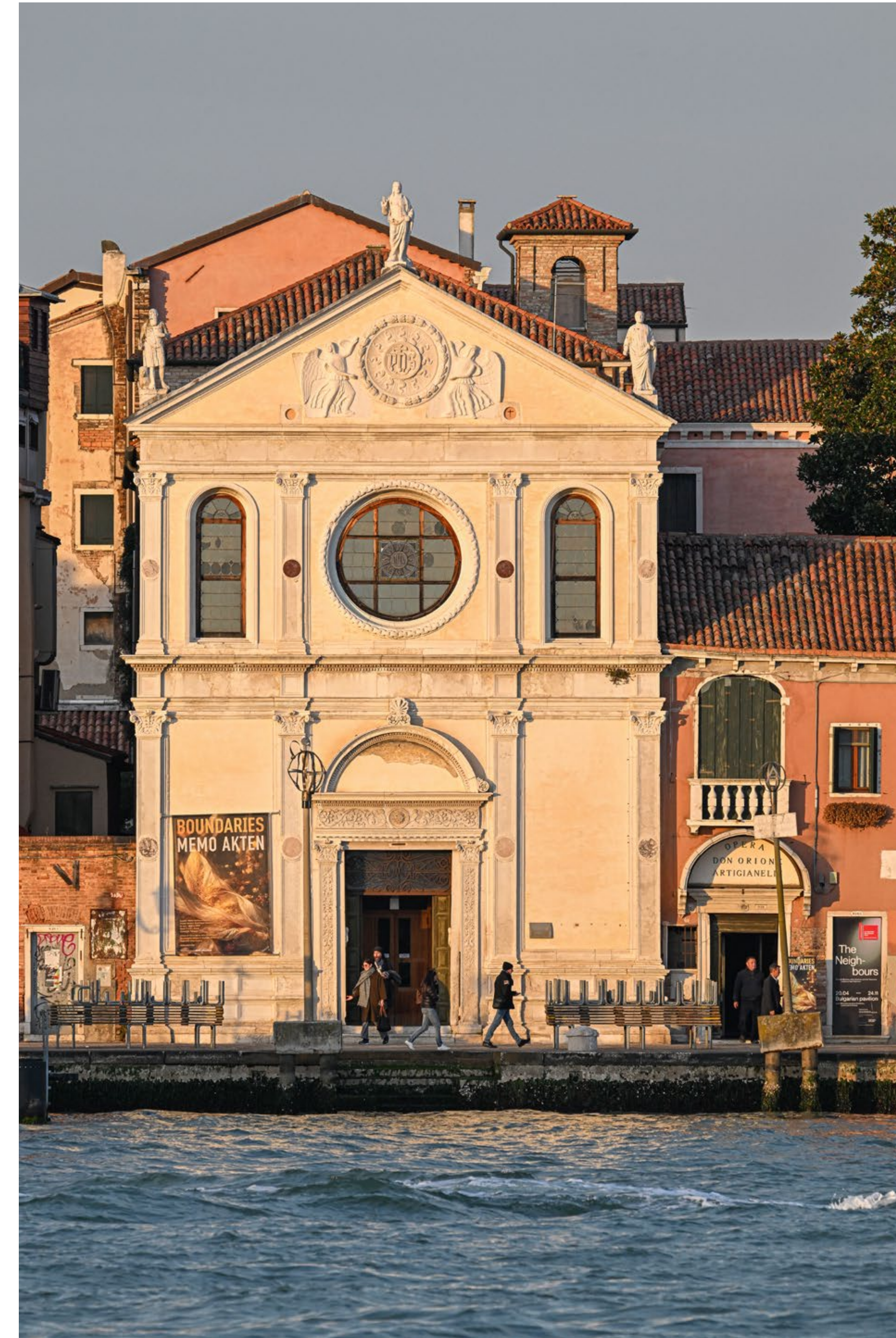
The island of Giudecca is a nice get away and you still get to point your telephoto lens at groups of people on San Polo.