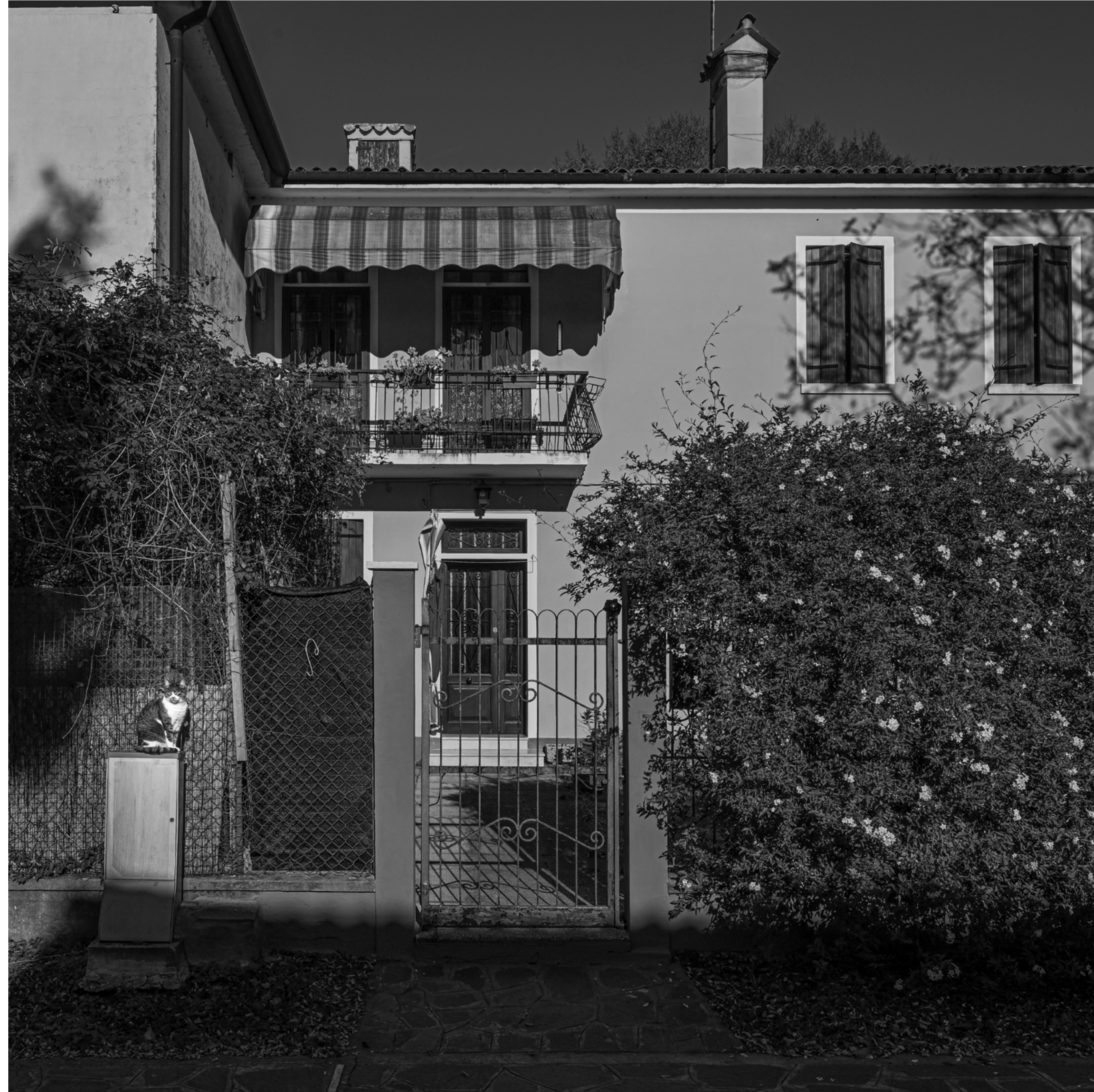
Very friendly cat on utility box. Would recommend.