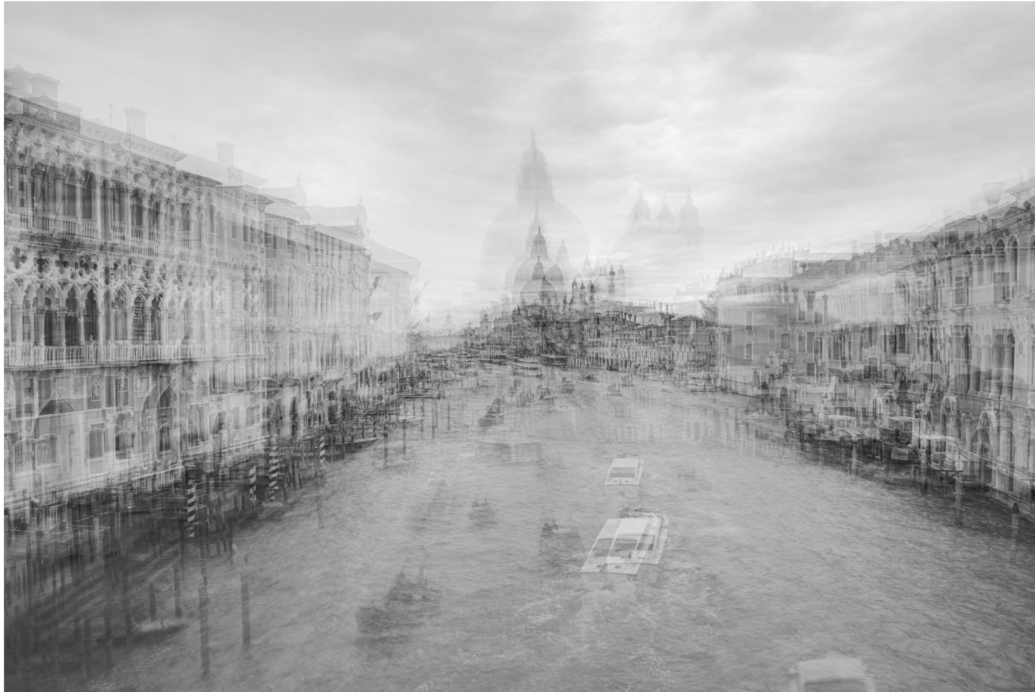
The Grand Canal featuring Basilica Santa Maria della Salute. Multiple exposure.