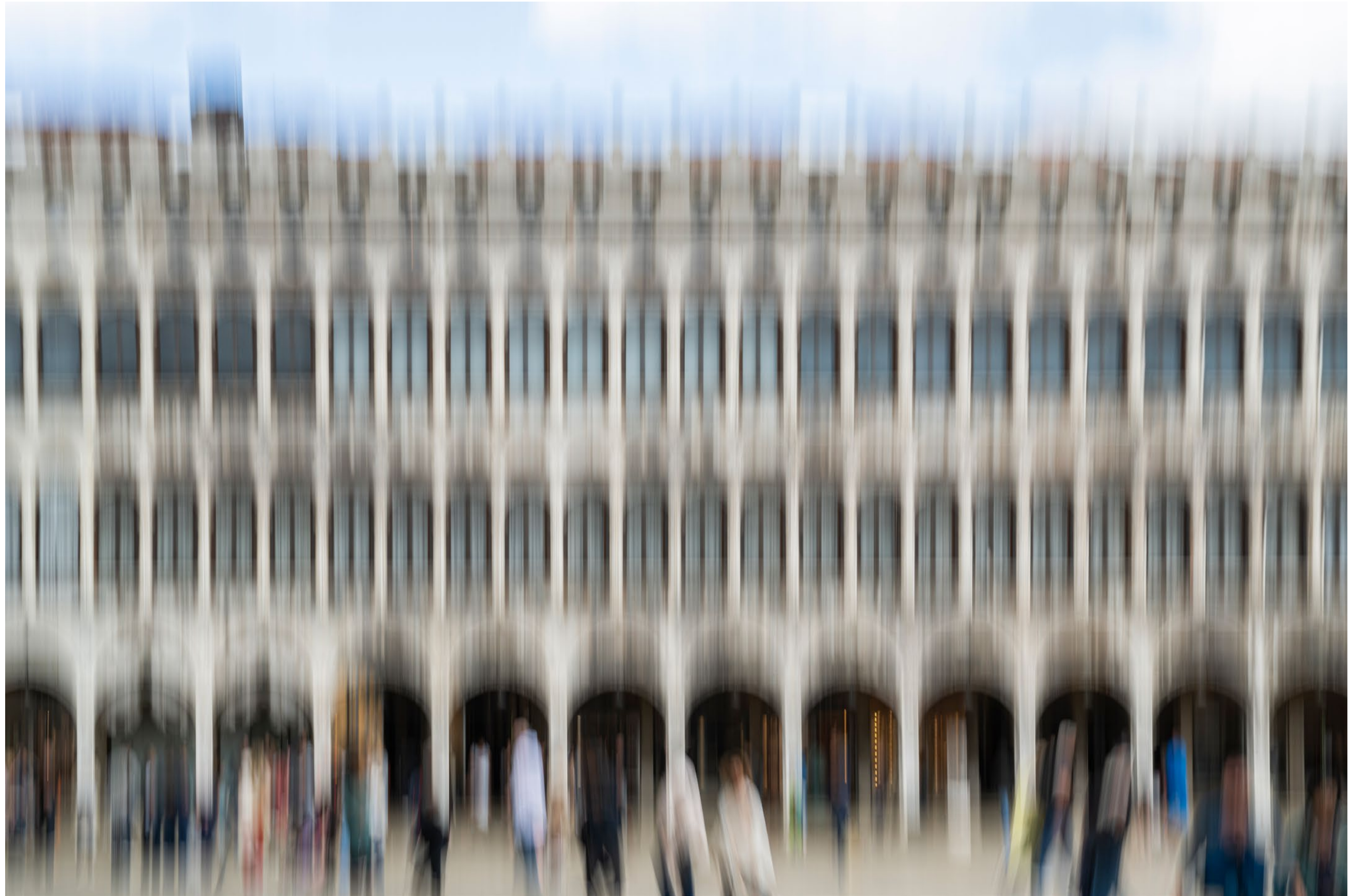
Piazza San Marco. Intentional camera movement.