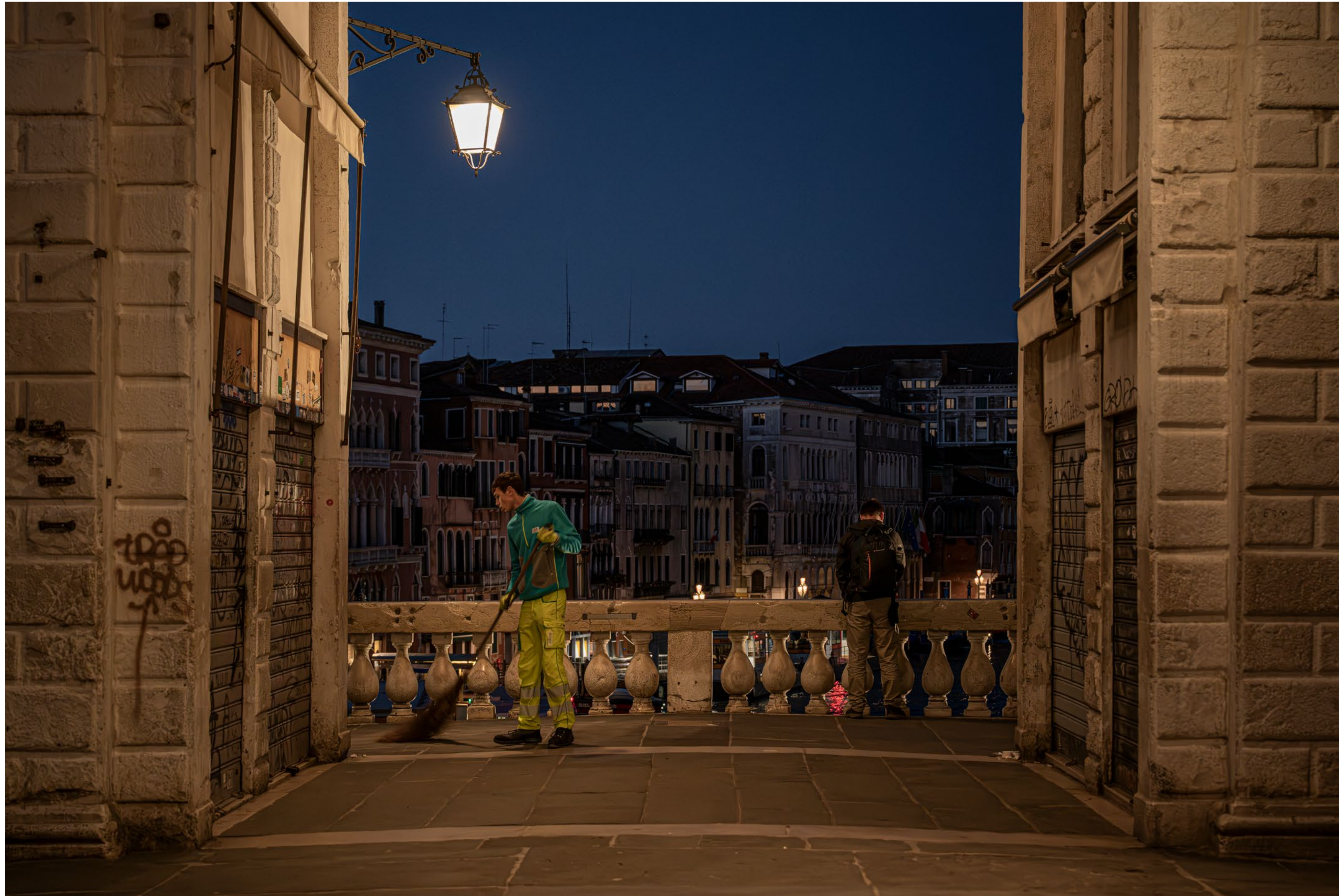
Respect to the army of cleaners that help keep Venice beautiful. These popular places are left in horrendous condition of an evening.