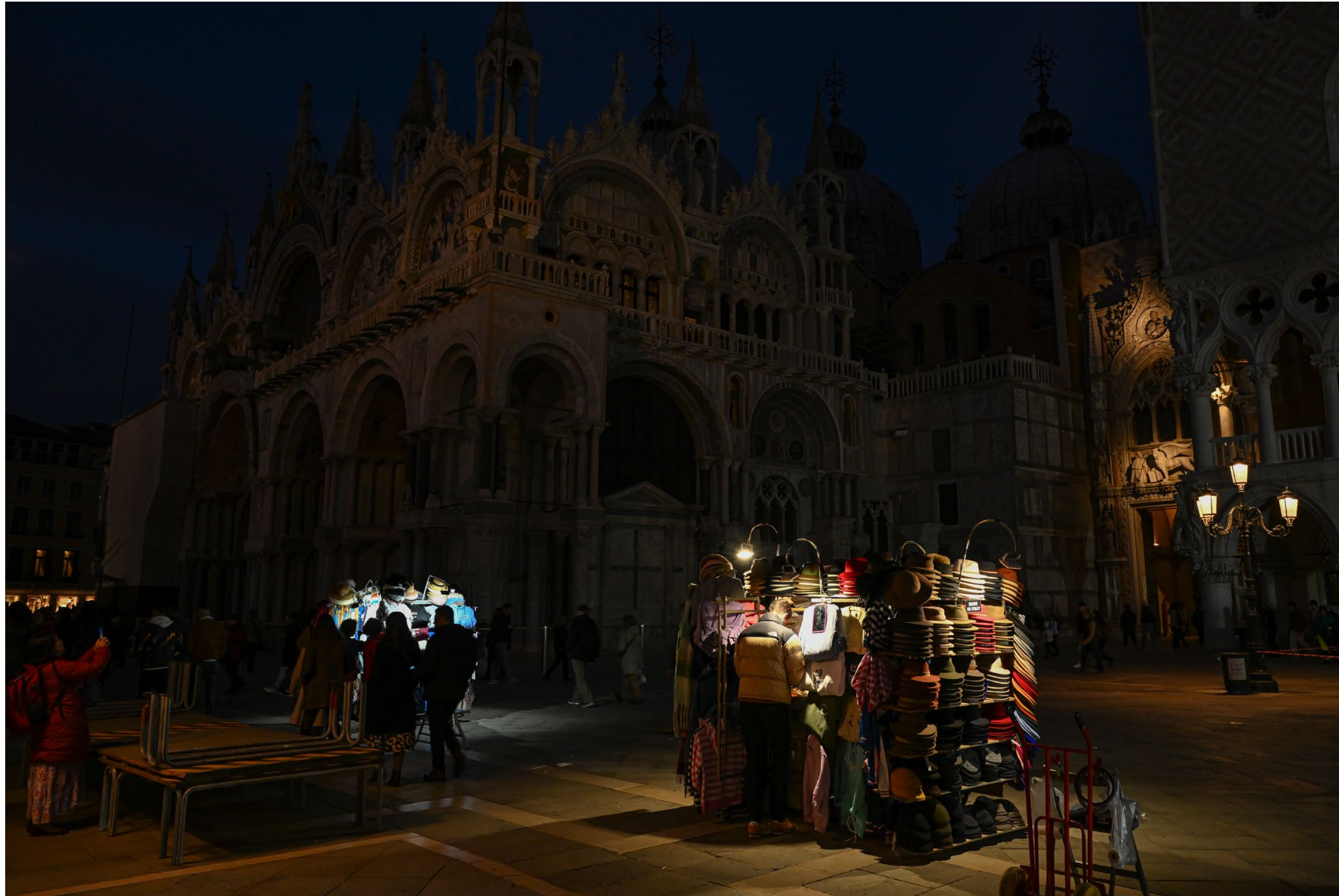
Come for the extravagant and opulent Basilica di San Marco, stay for the exceptional selection of hats.