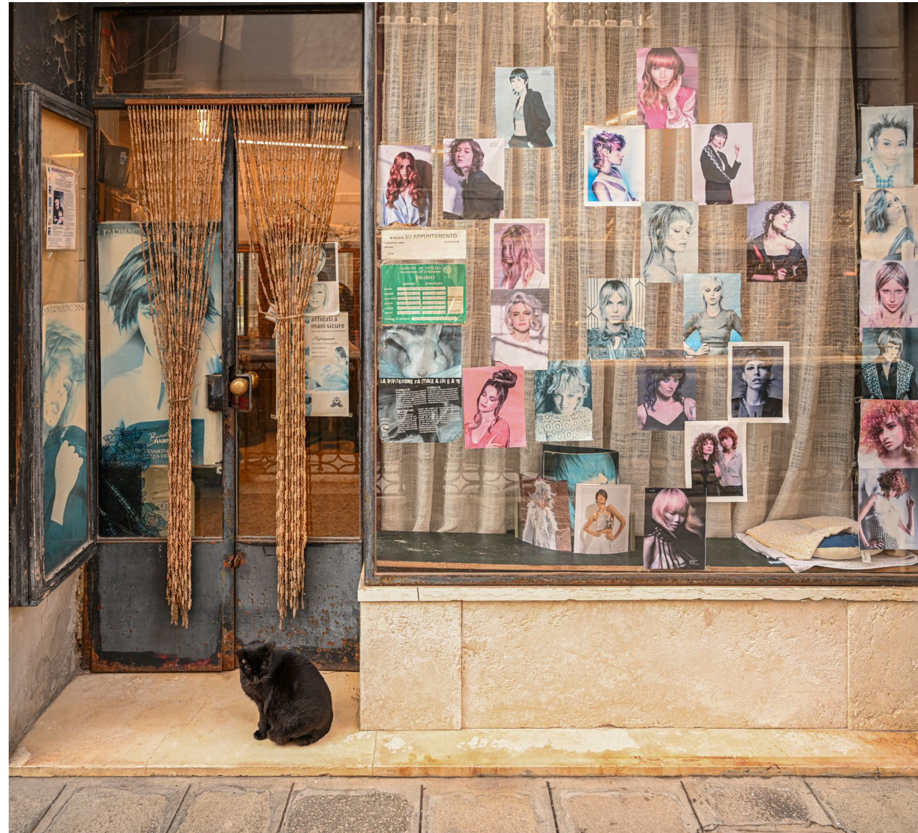
The cat demands entrance.