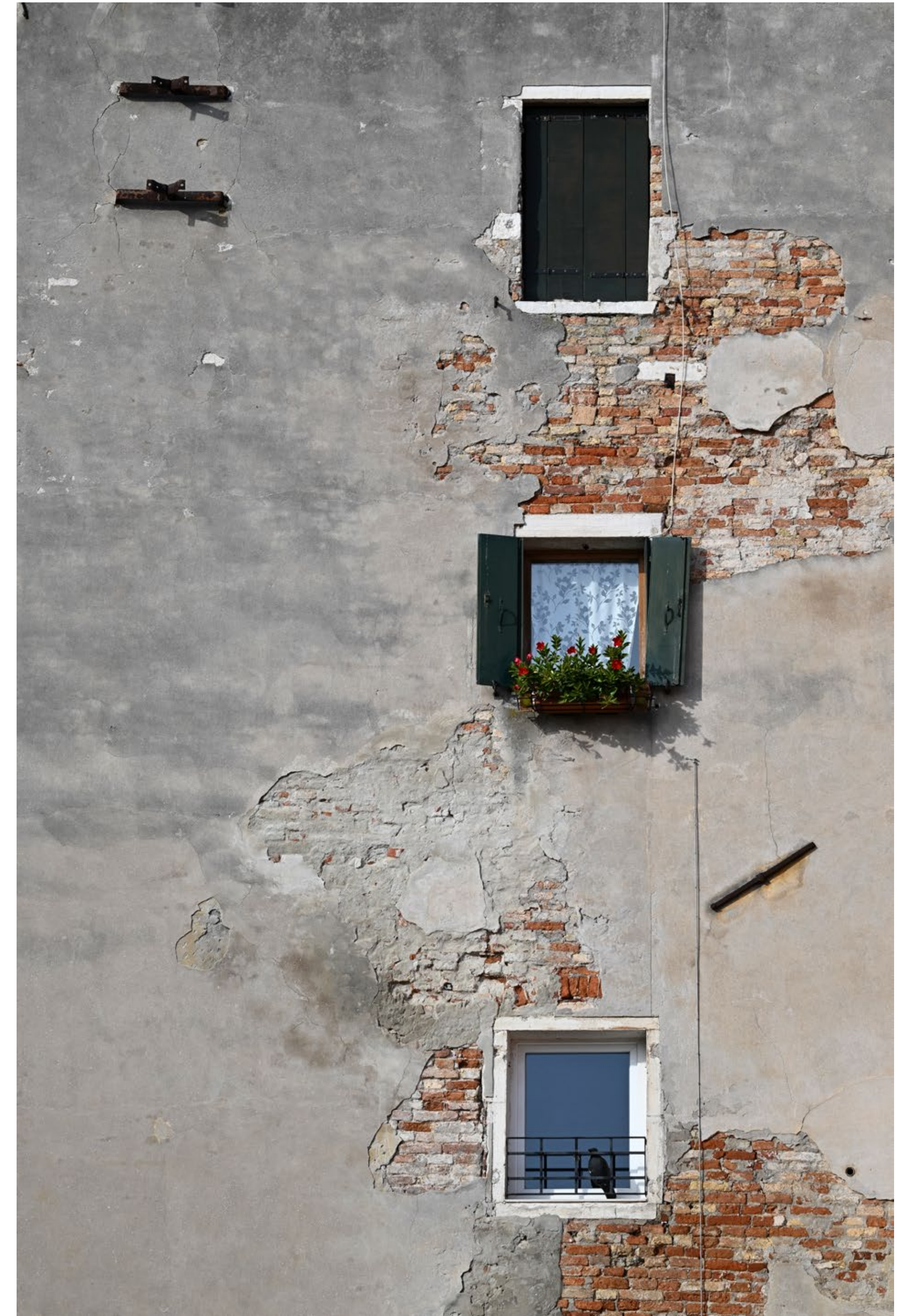
Pigeons rule this city. Fake falcons are even positioned on some windows (third image) to prevent their complete domination.