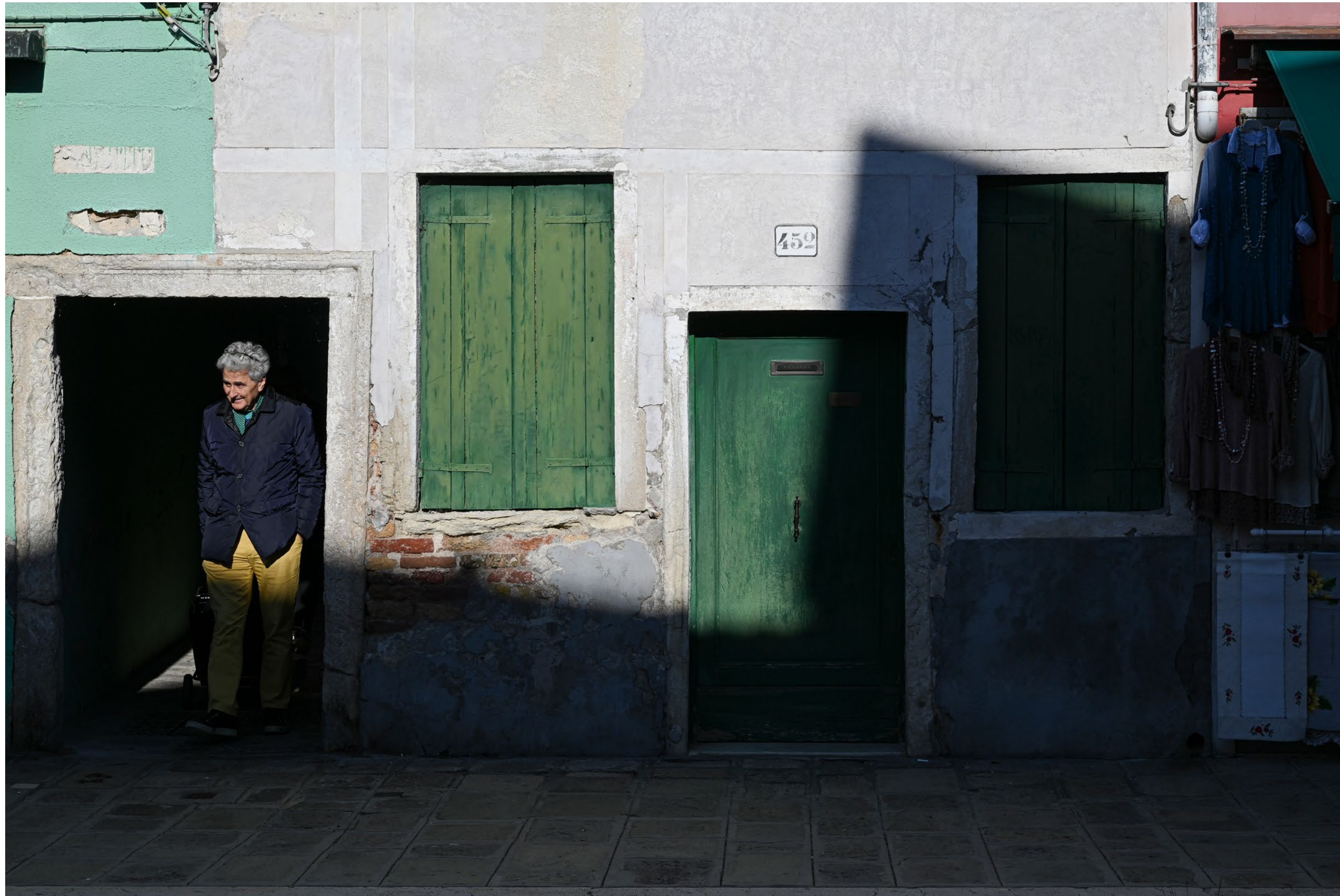
Playing with light in Burano.