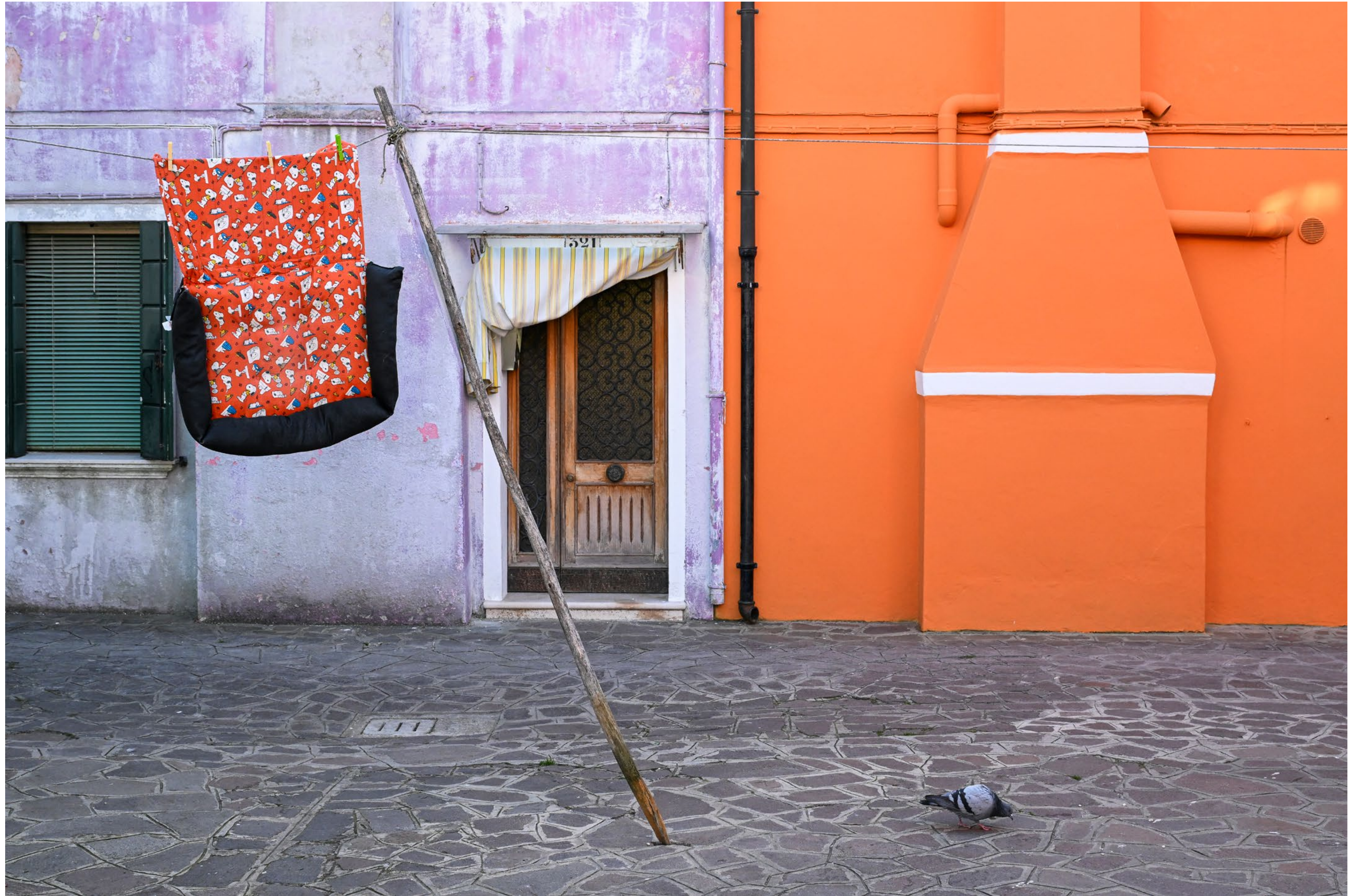
Peanuts and Snoopy seem to be very popular here.