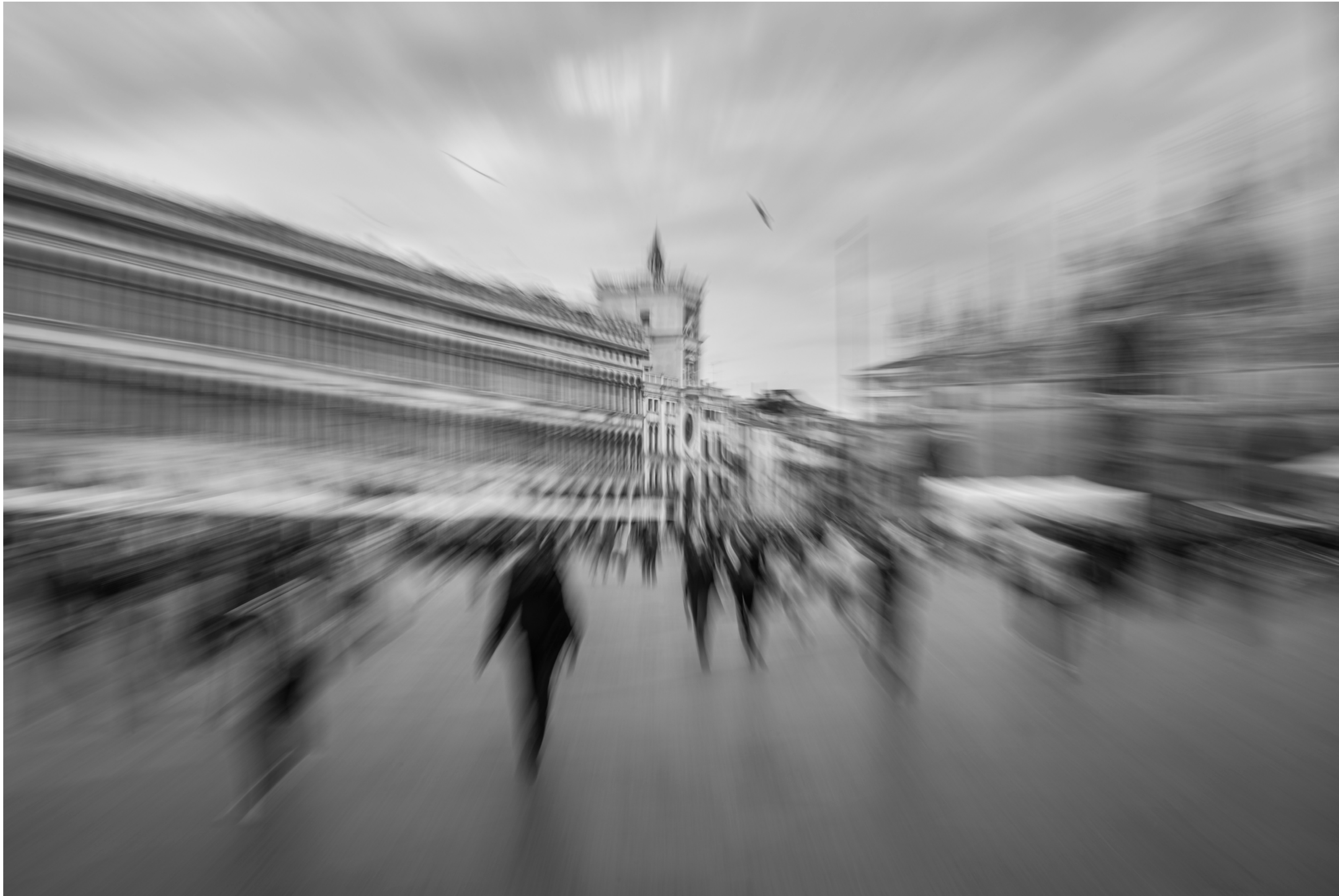
Piazza San Marco, one of the busiest places in Venice. Intentional camera movement.