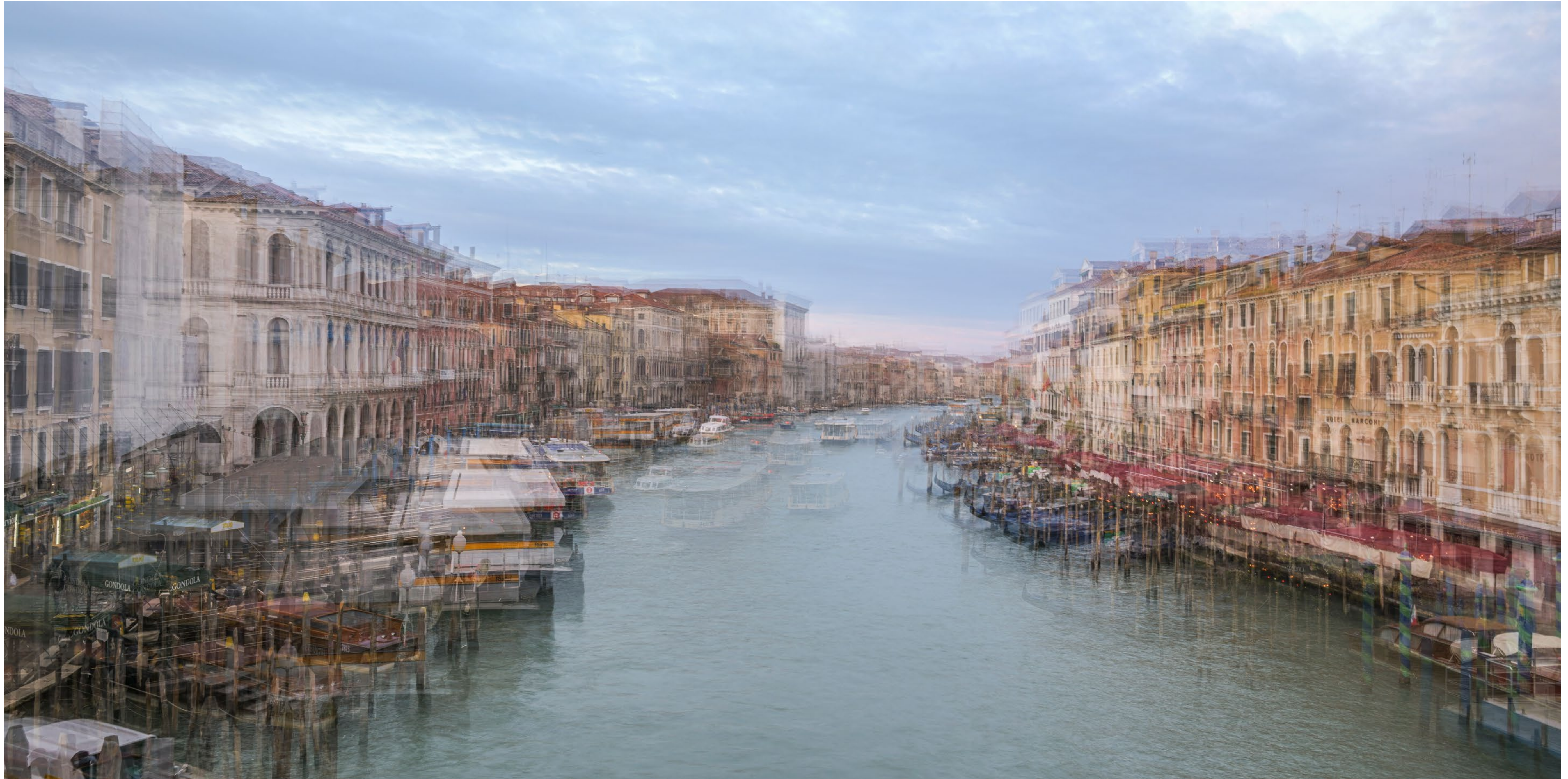
The grand canal becomes a chaotic dance of boats as the sun rises each morning. Multiple exposure.