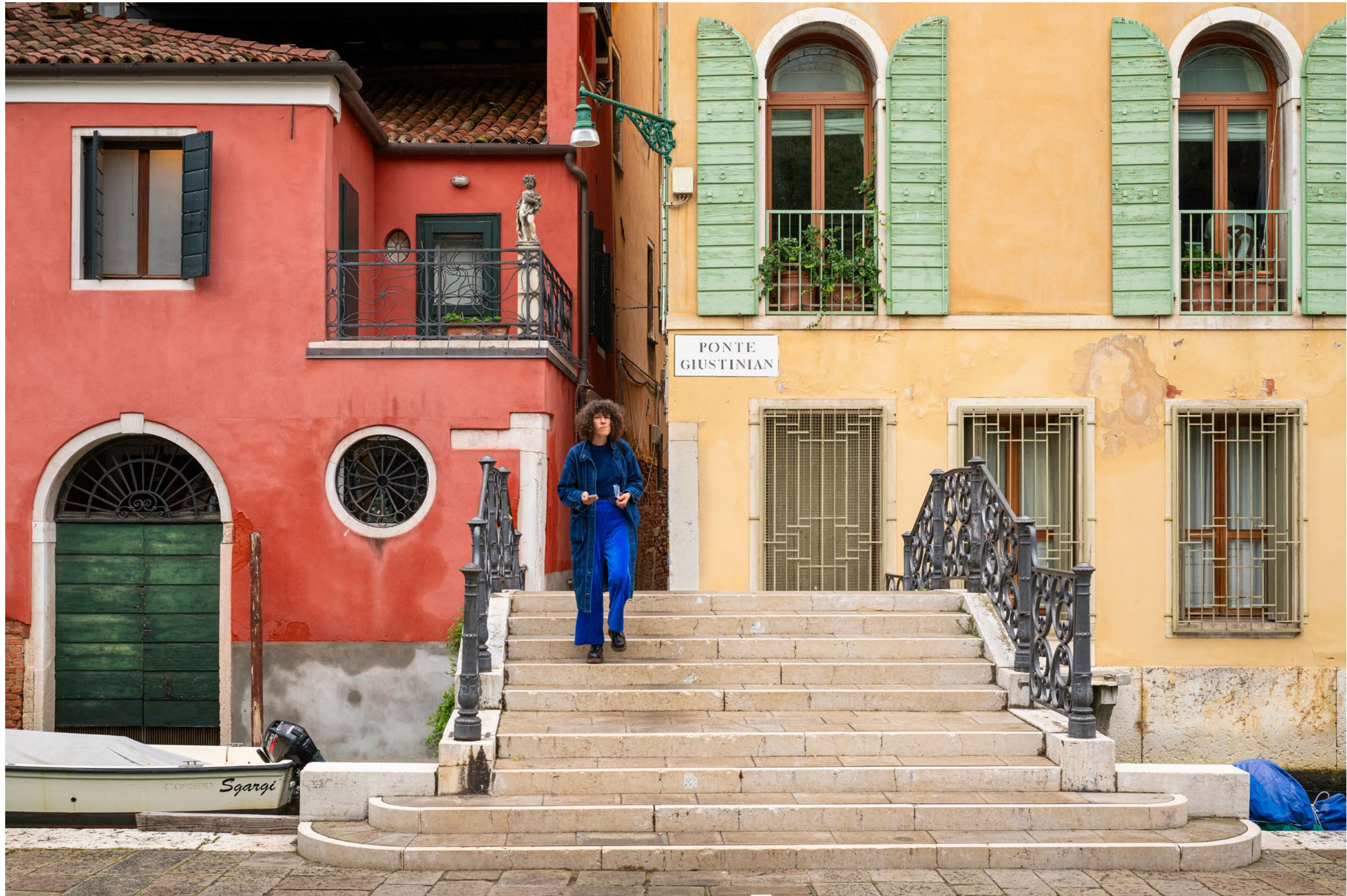
RGB (and a little yellow).