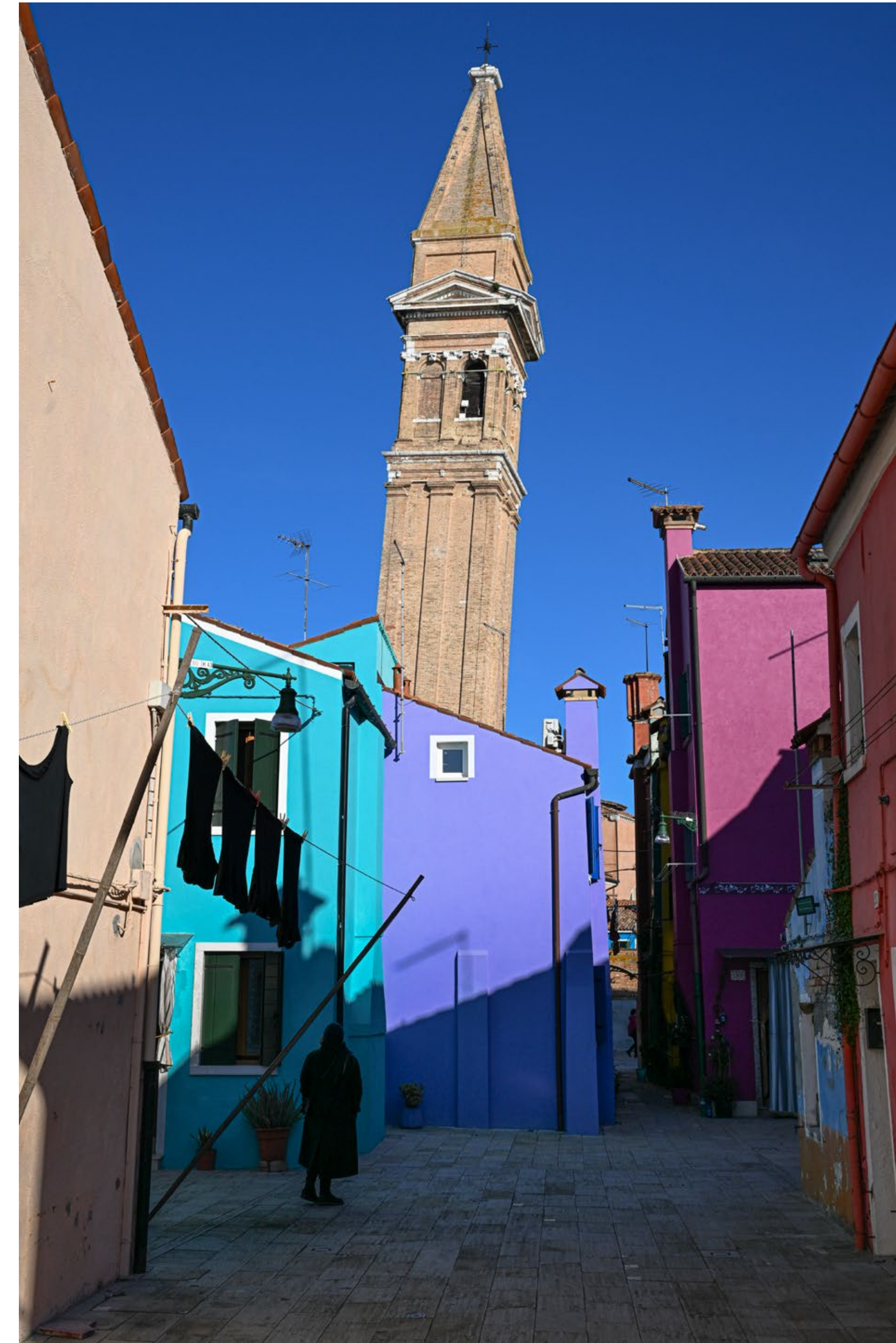
Religious iconography must be positioned on an angle.