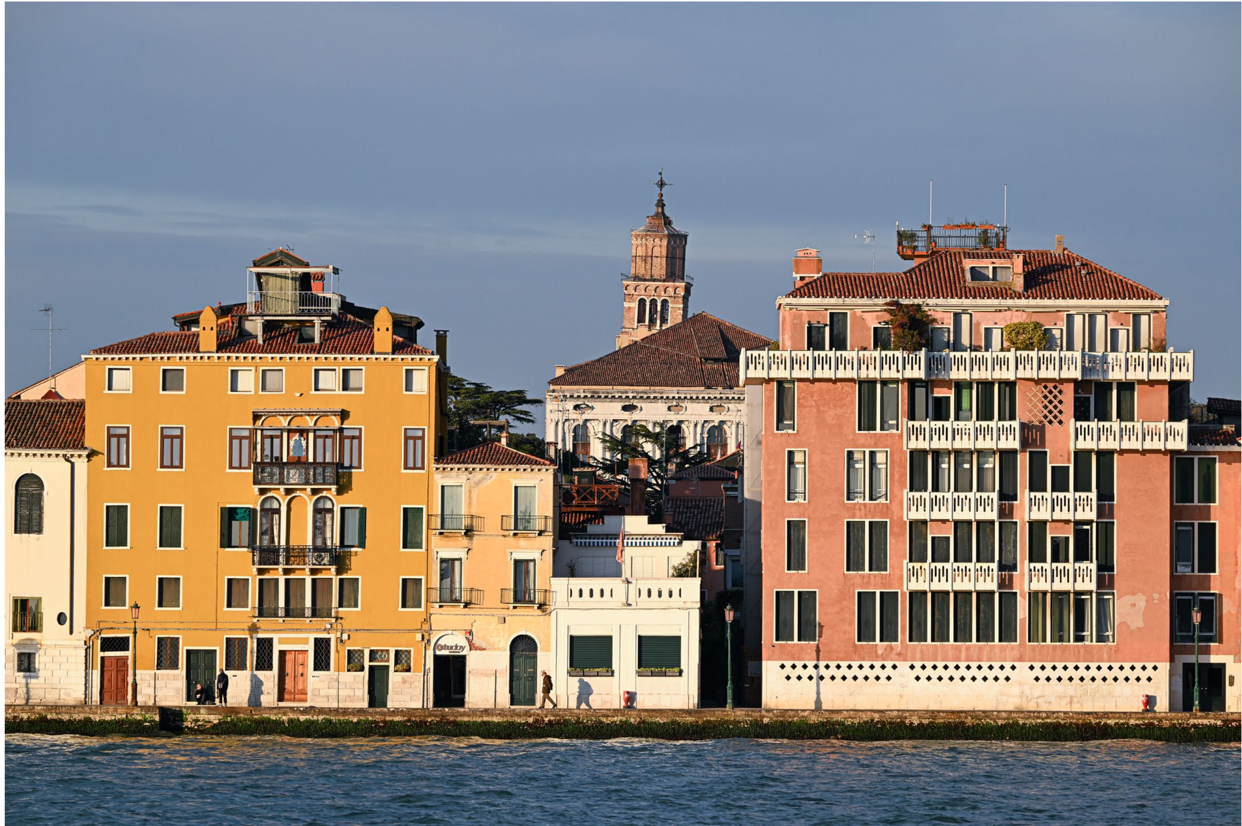
More spying from Giudecca.