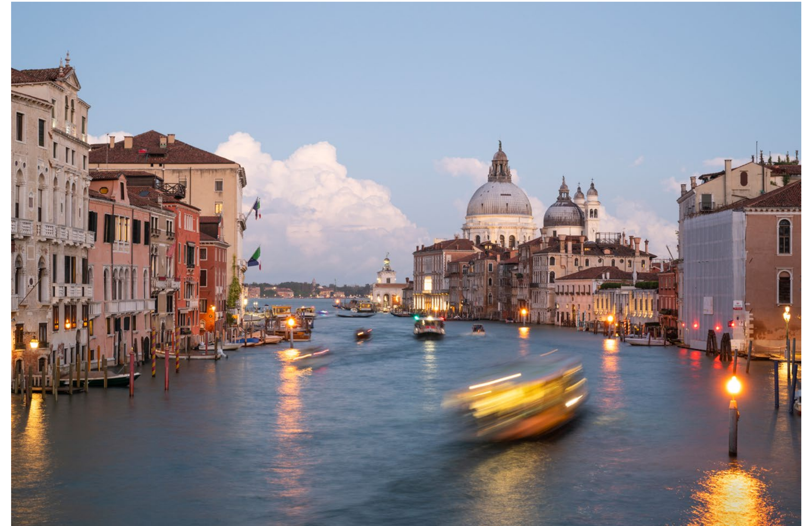
View from Ponte dell'Accademia, one of the most popular viewpoints of the Grand Canal.