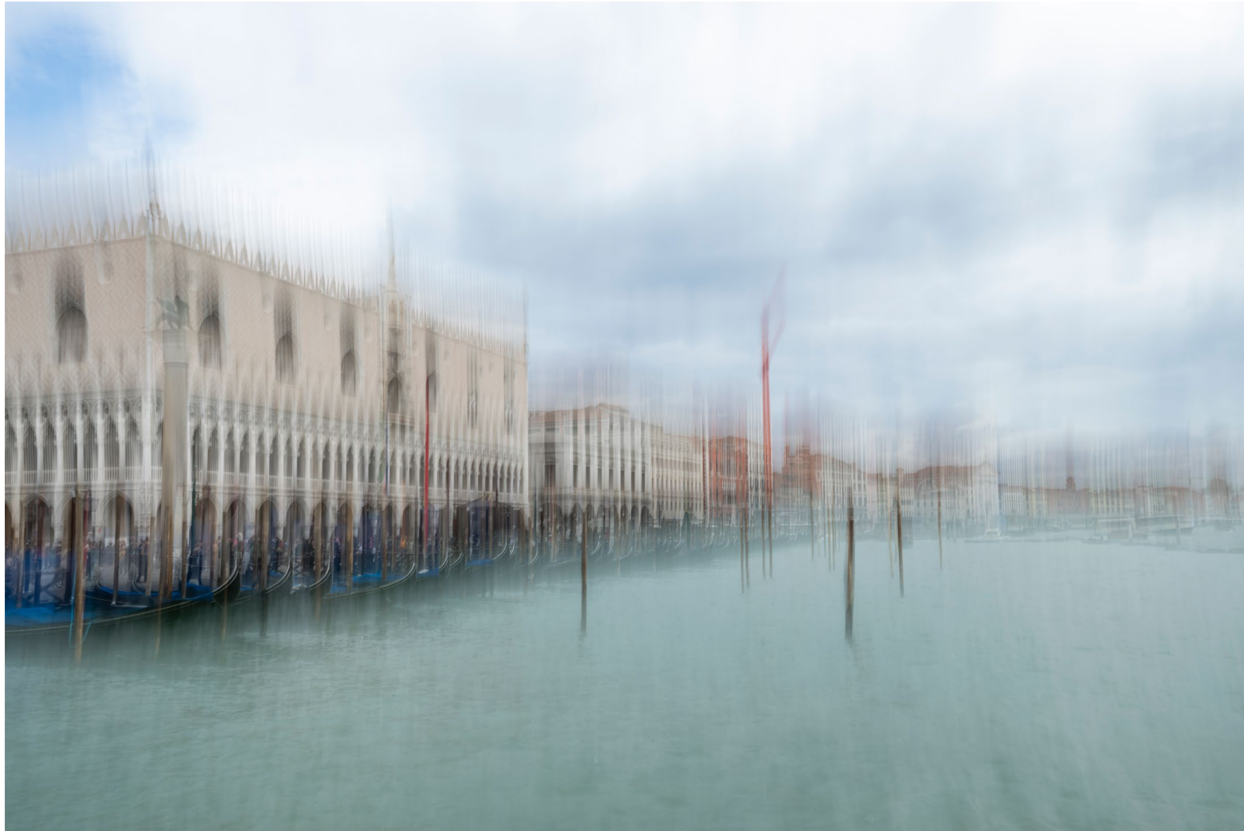
Palazzo Ducale (Doge's Palace, not to be mistaken with the famous dog). Intentional camera movement.