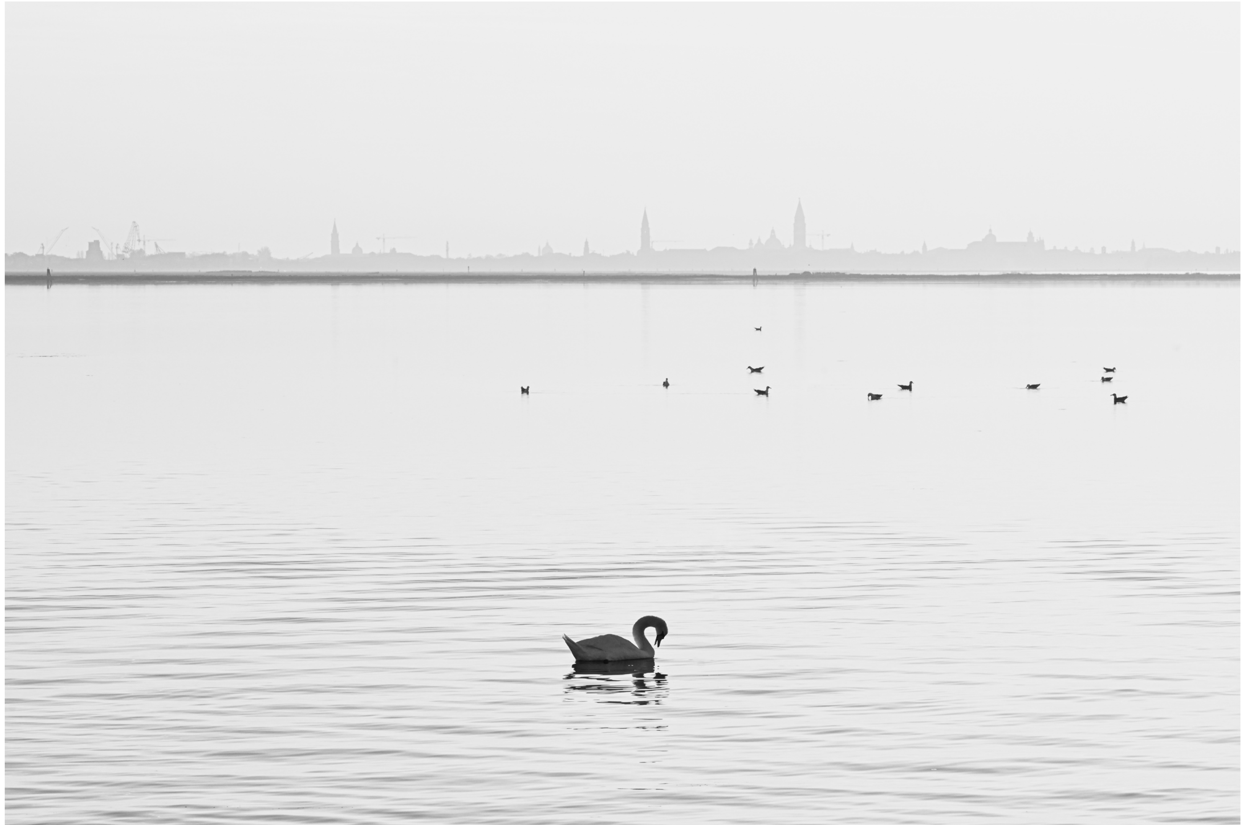
Sunset from Burano, looking back towards the main islands.