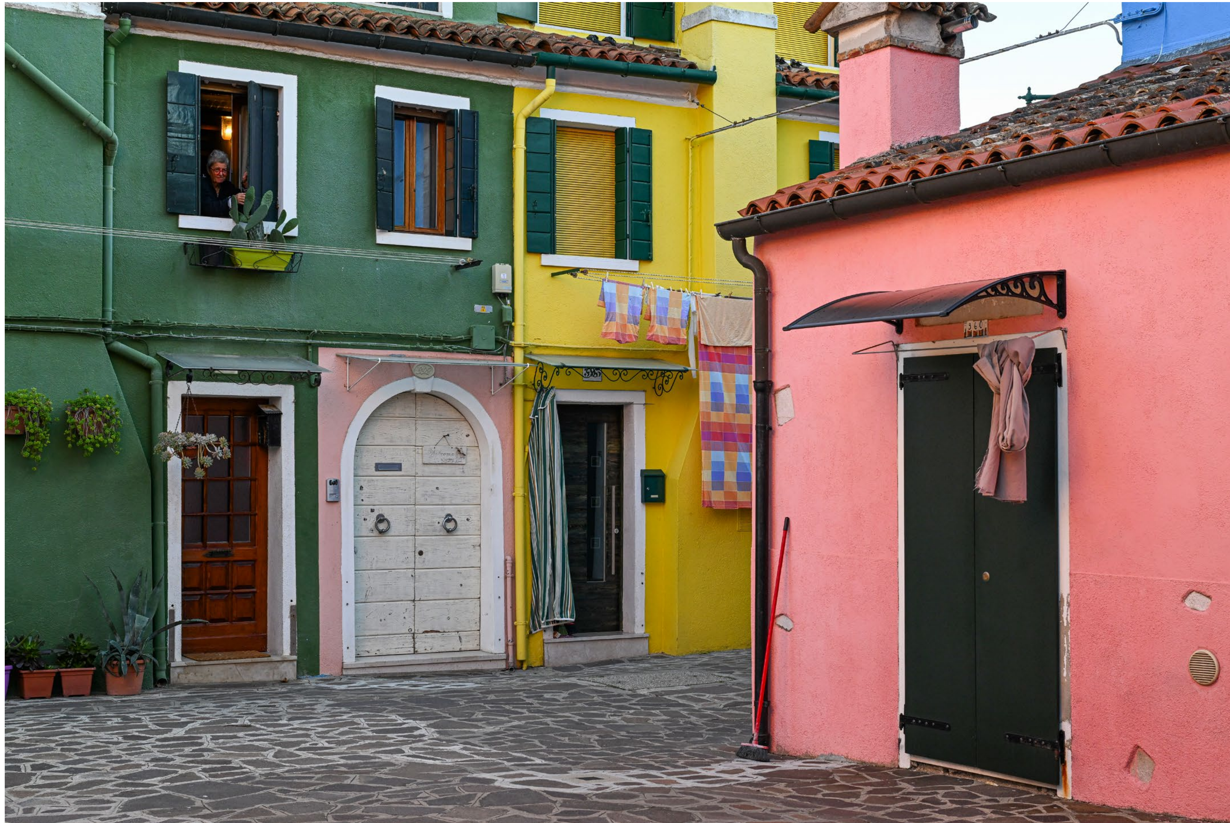
Burano street scene.