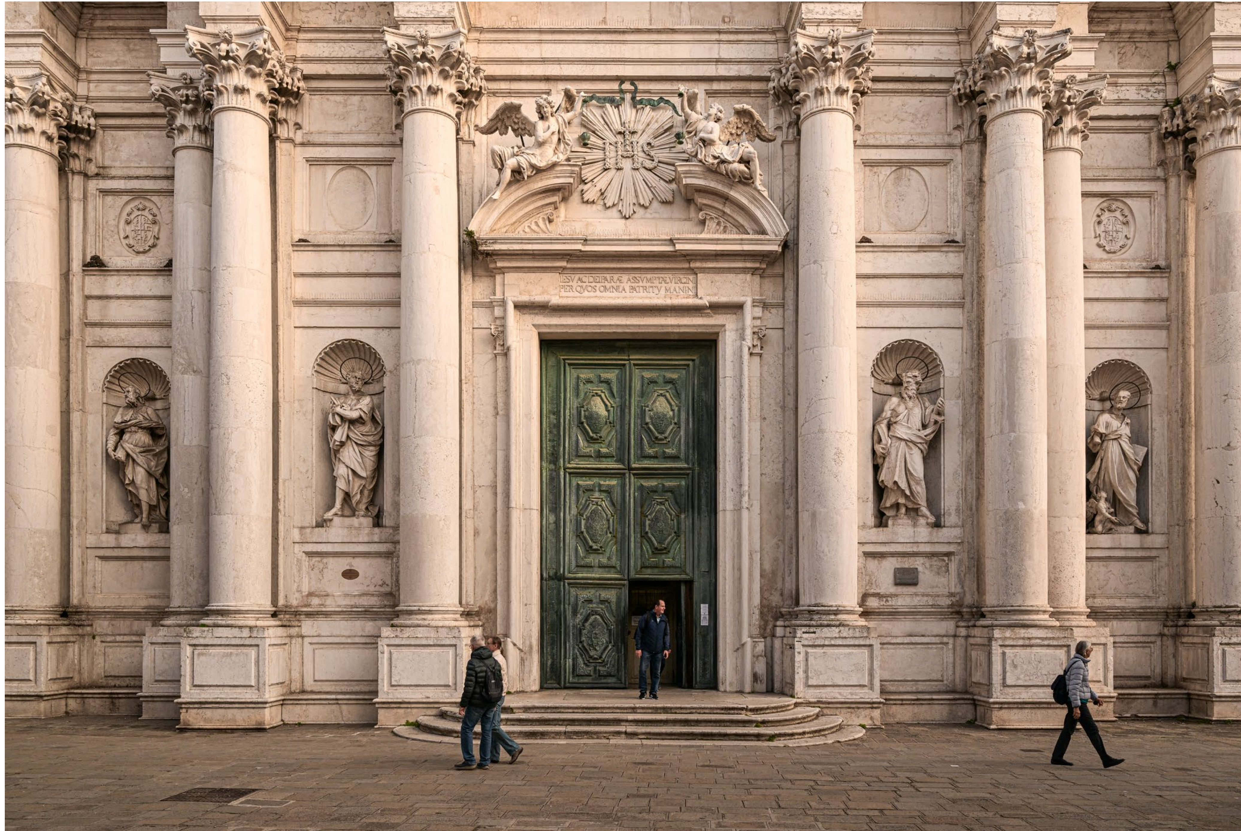
Man stands near building. An absolute pillar of street photography.