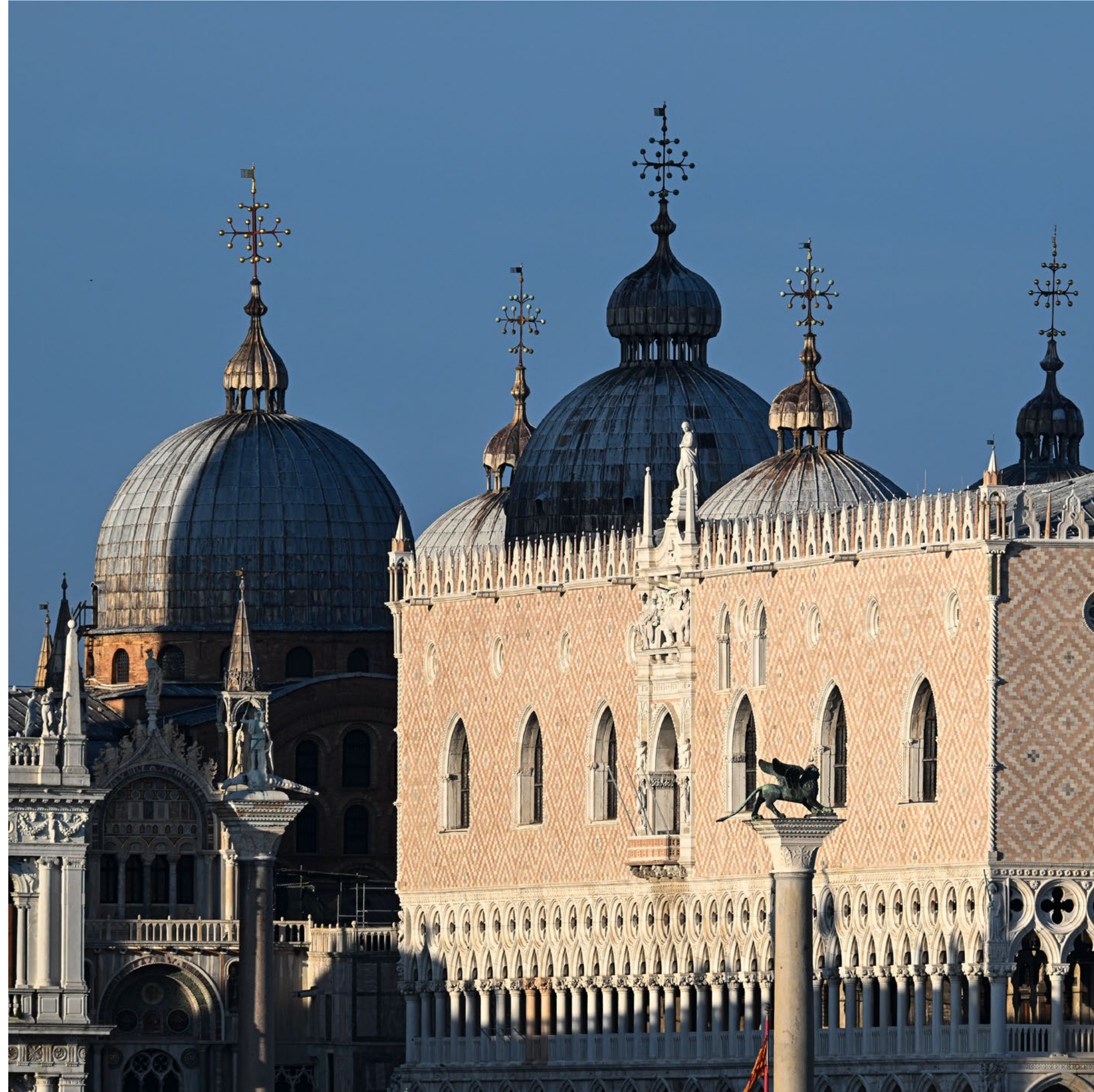
They loved a pinnacle in ancient Venice.