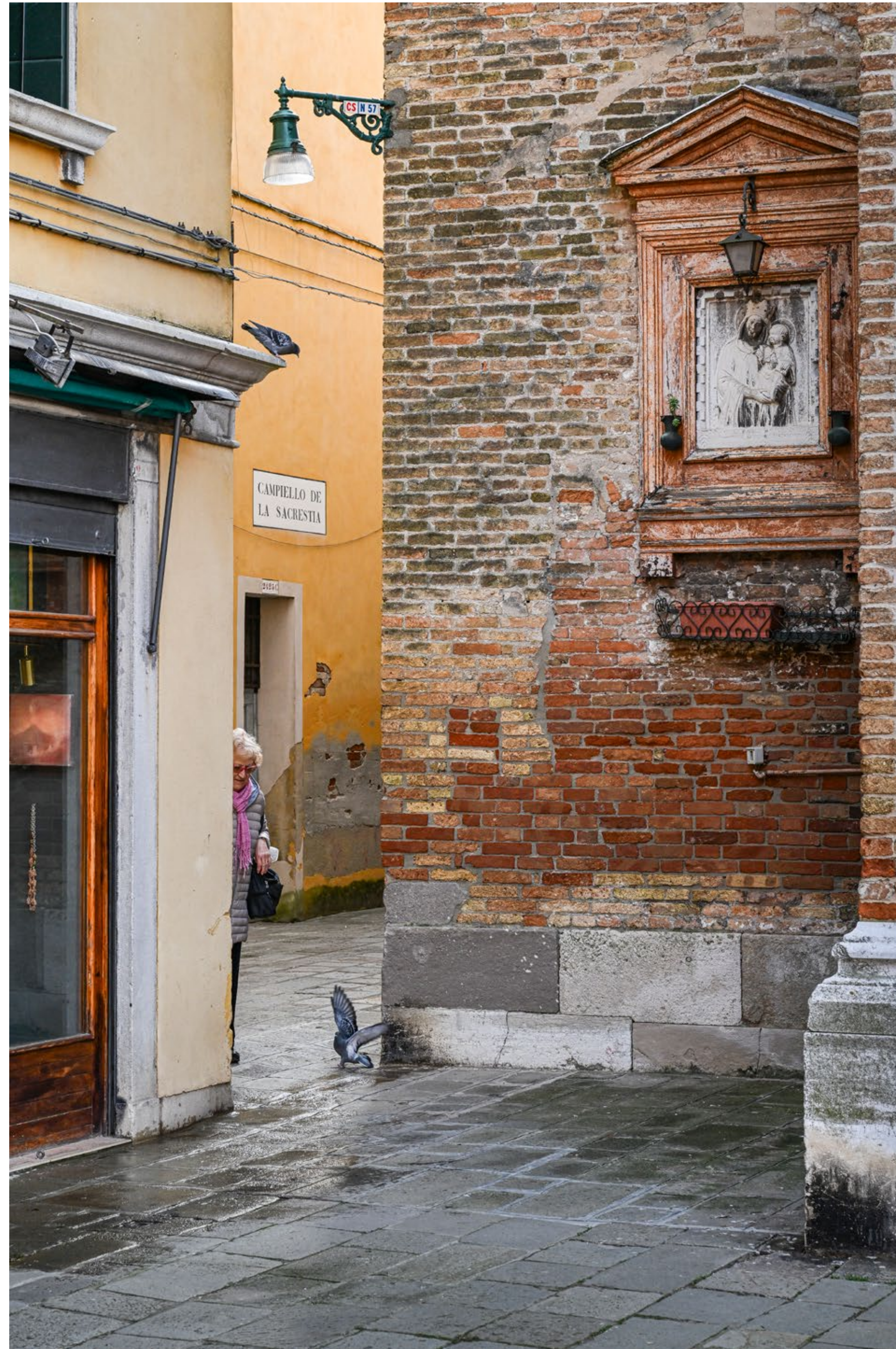
This pigeon has a spotter.