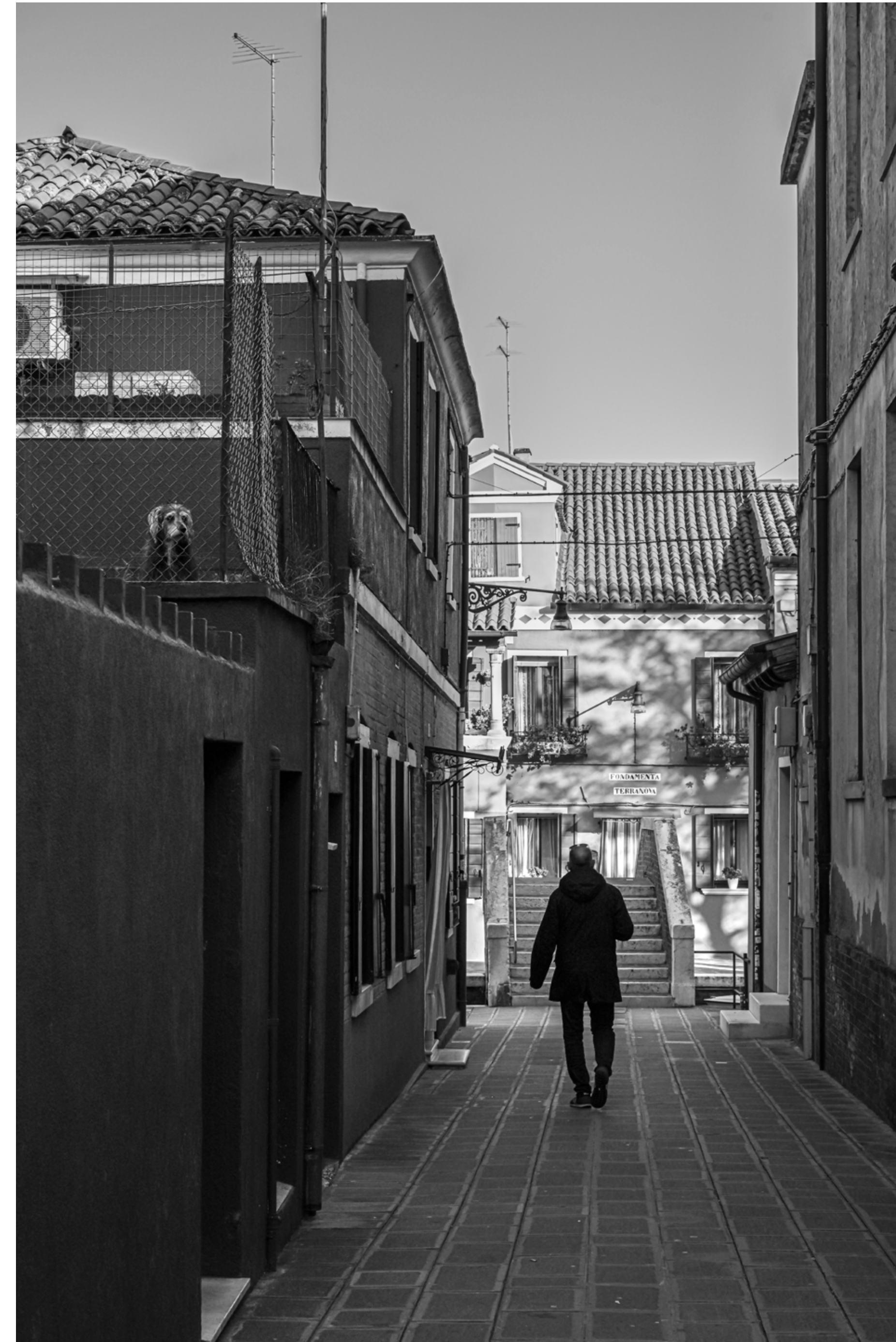
The dog (right) is in fact a voyeur. Told me himself.