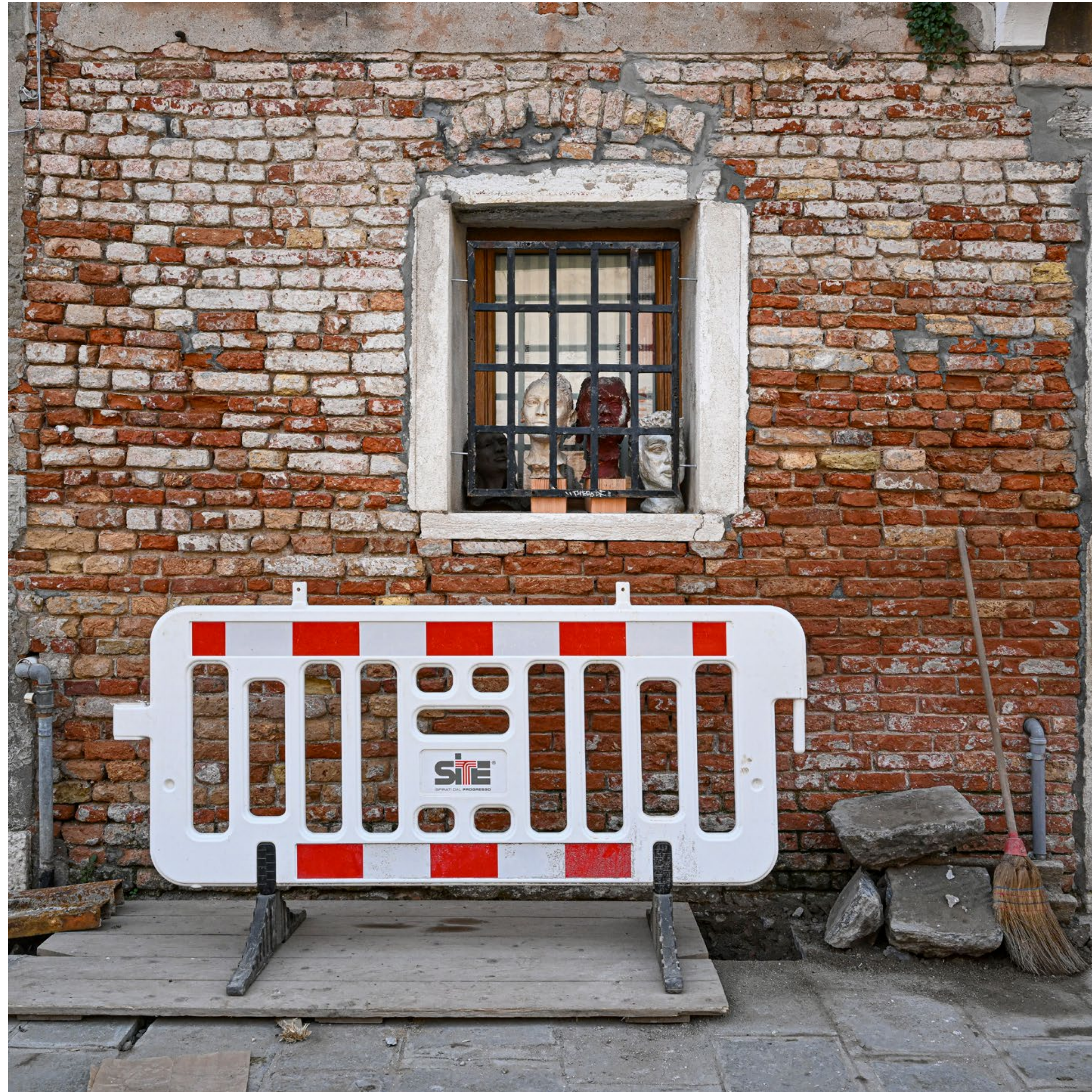
These busts have been imprisoned for crimes too heinous to discuss here.