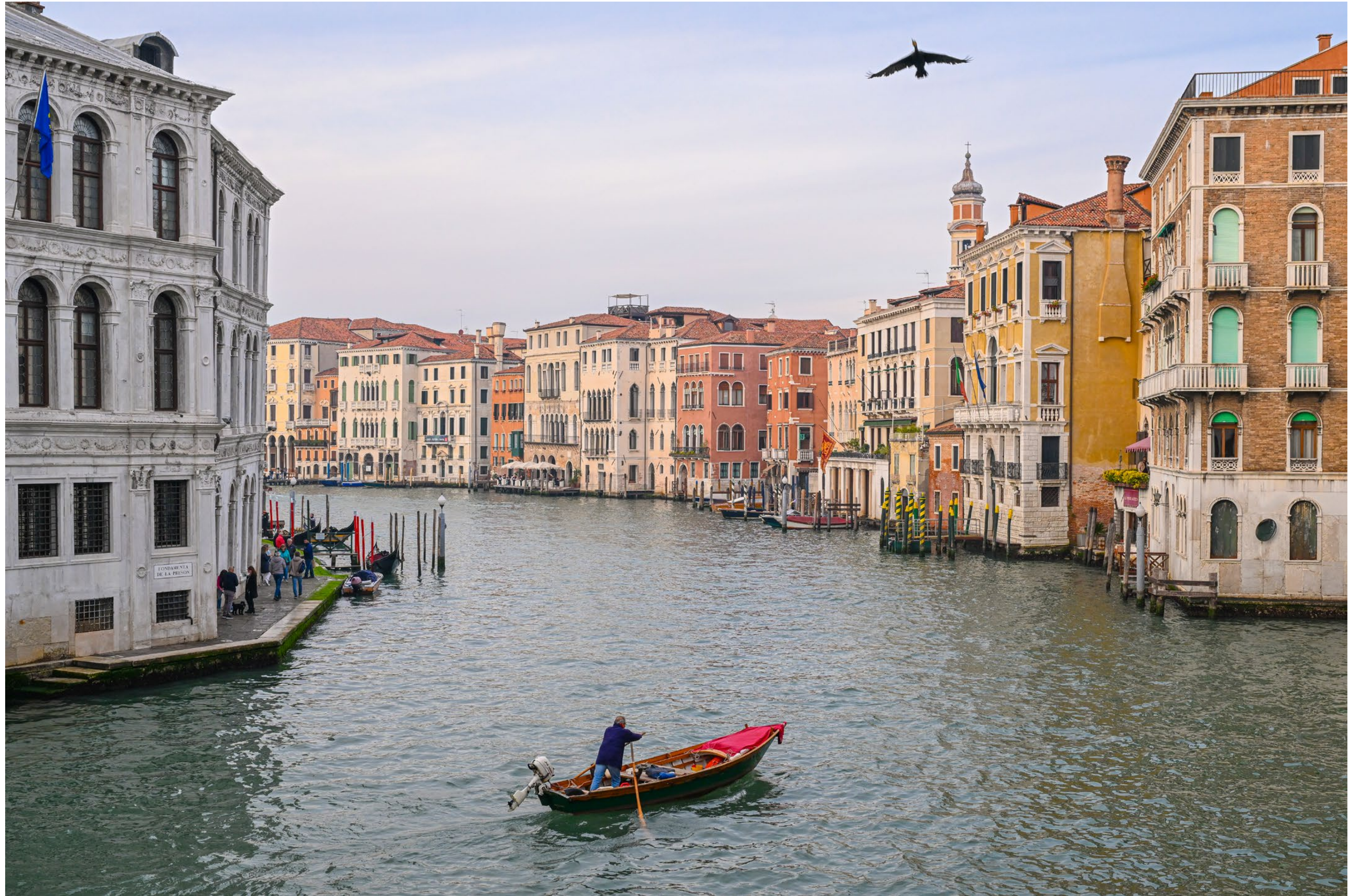
This man IS the engine.