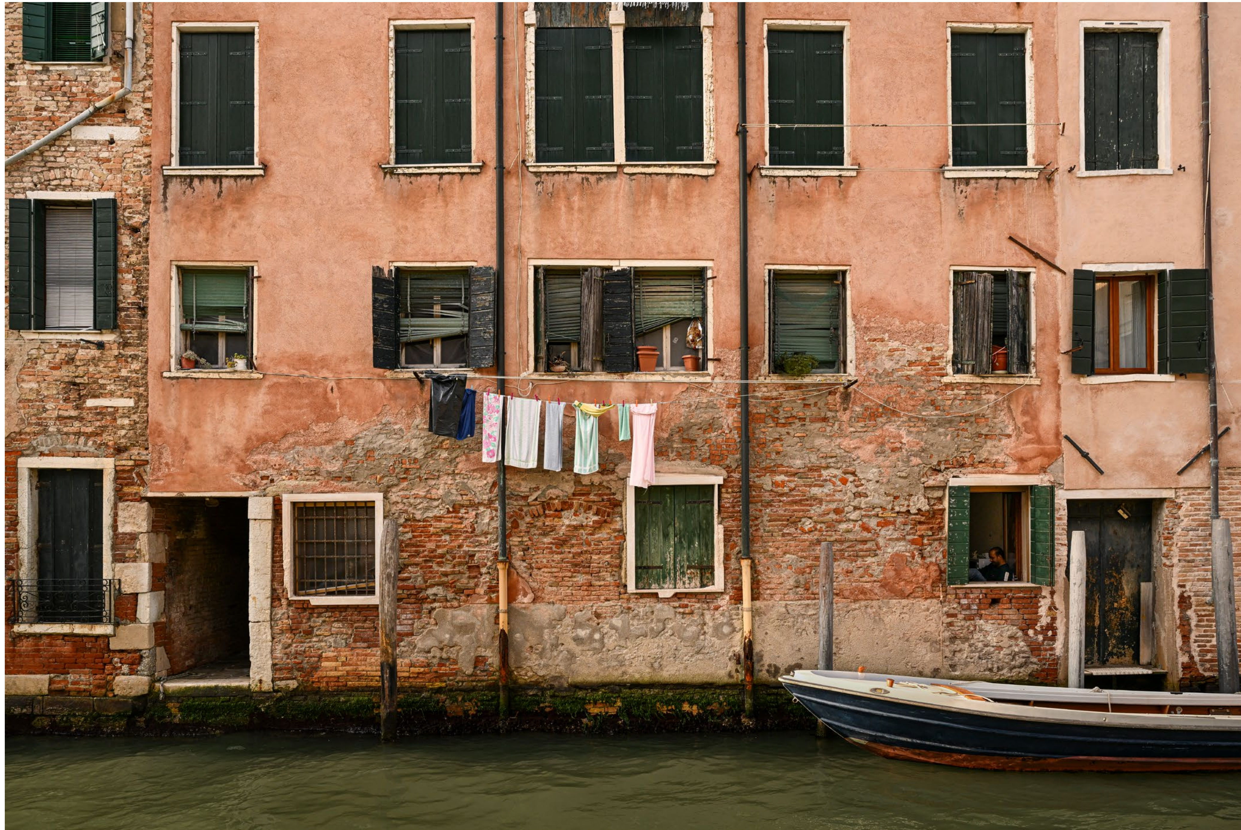
Washing lines in Venice. Those window blinds must be a nightmare to maintain.