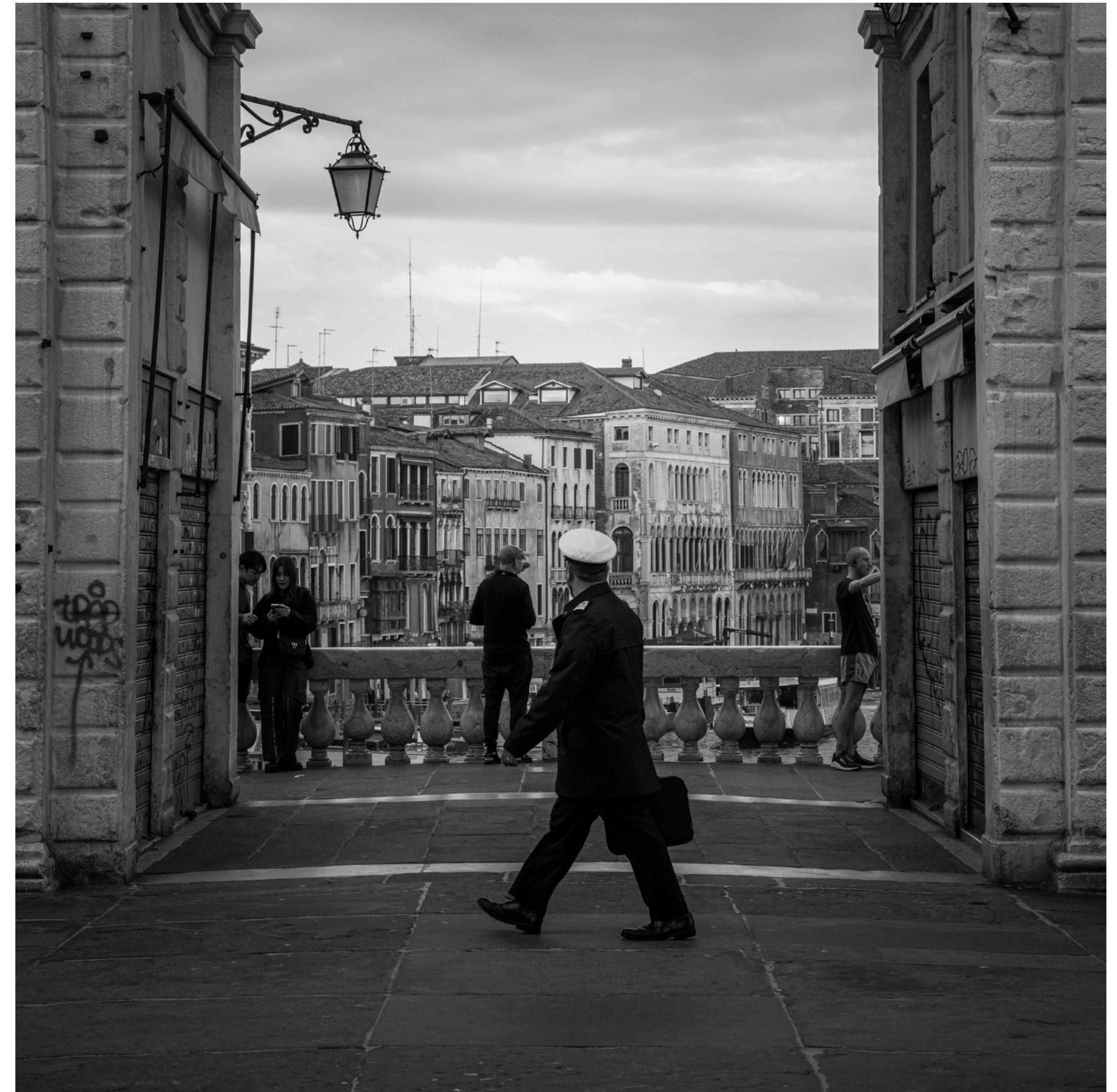
The street lantern budget is strong.