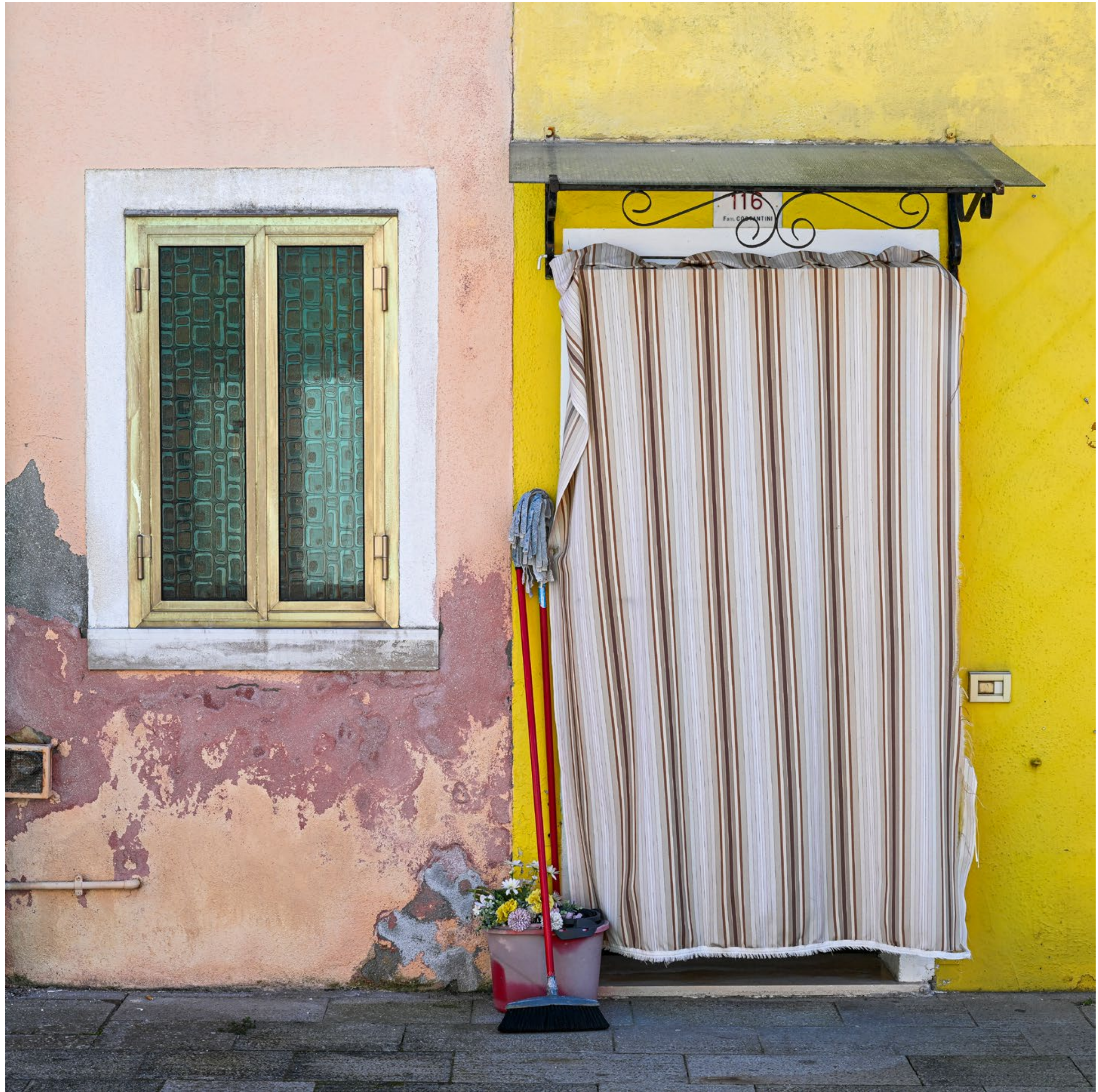
Left: As I was saying...