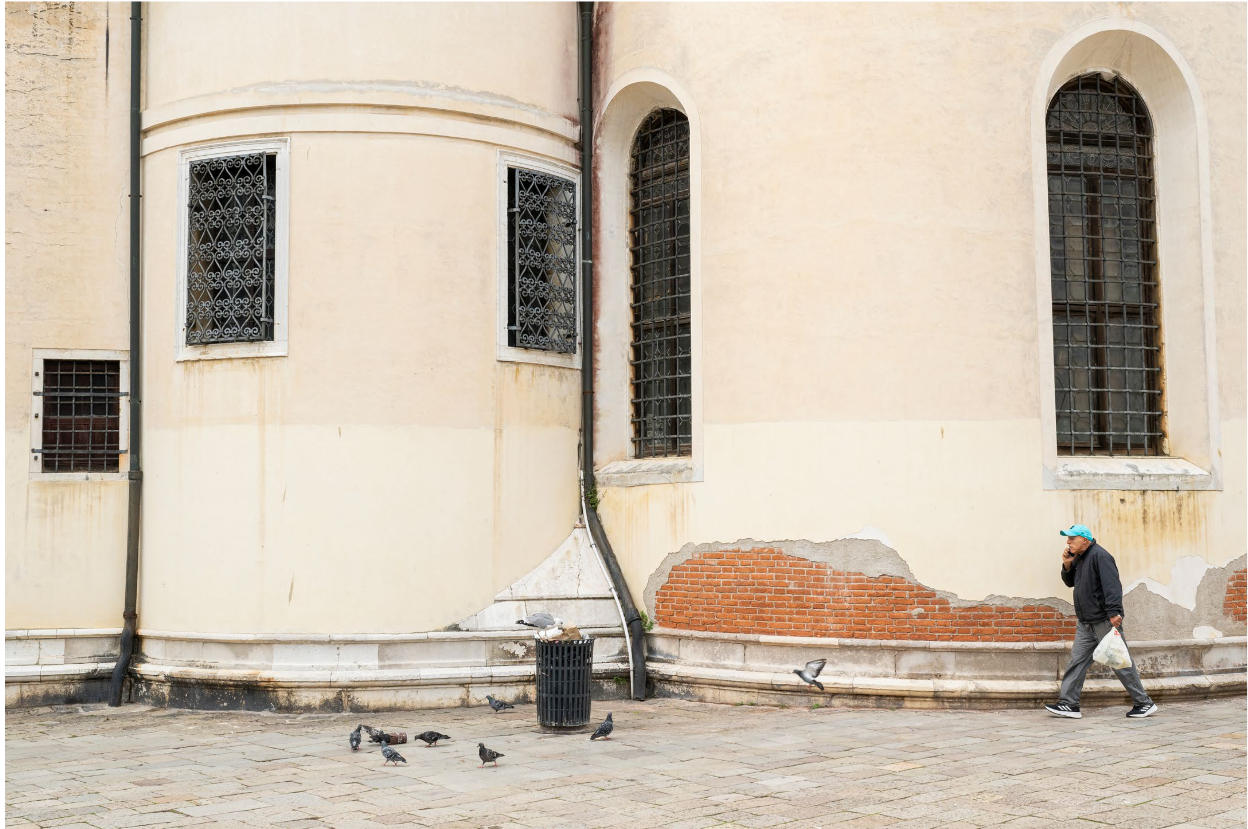
Greedy gull. That hat isn't messing around either.