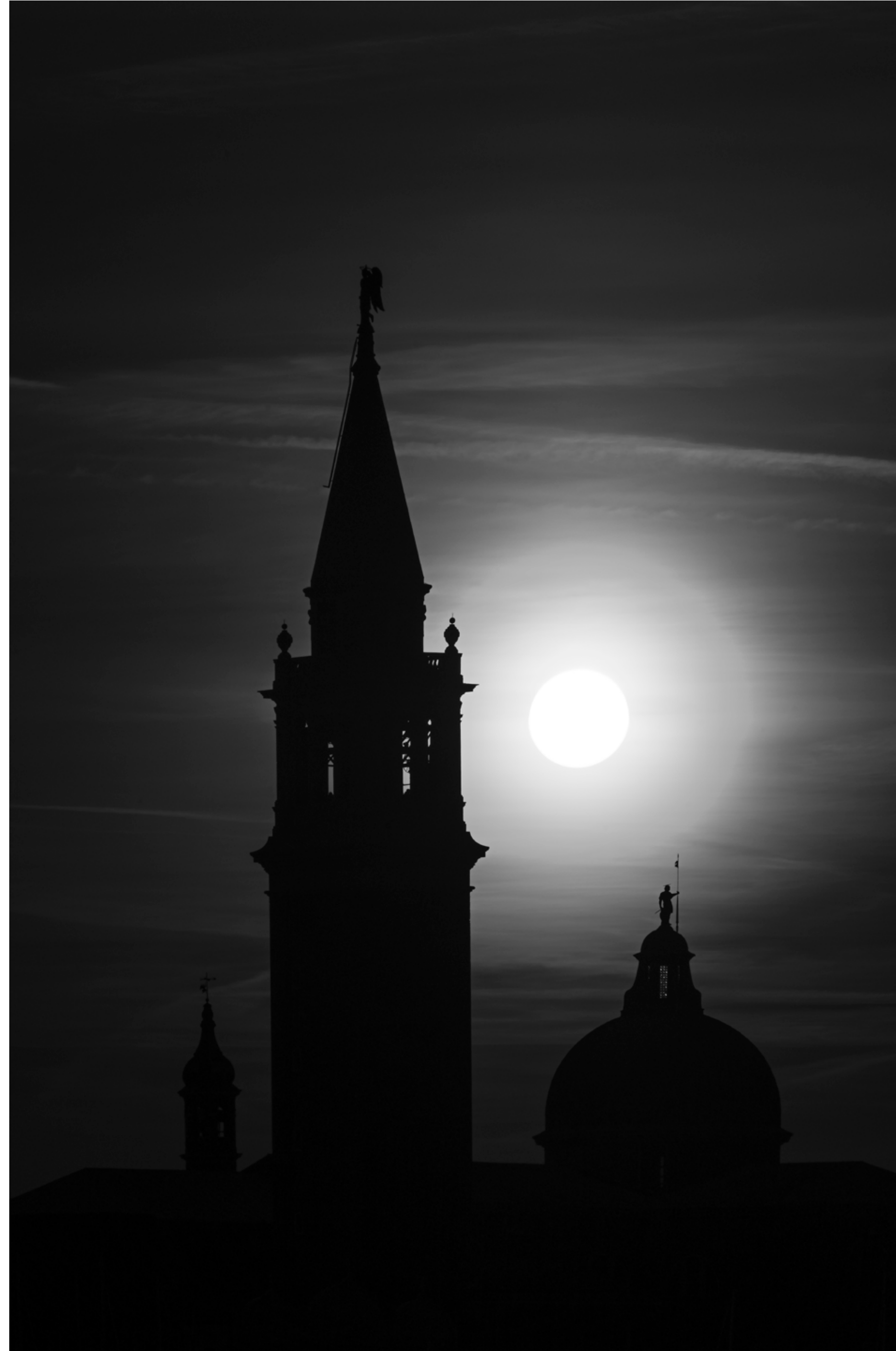
San Giorgio Maggiore Church